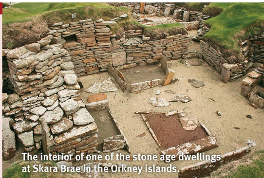
The interior of one of the stone age dwellings at Skara Brae in the Orkney islands.