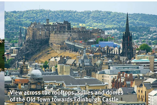
View across the rooftops, spires and domes of the Old Town towards Edinburgh Castle