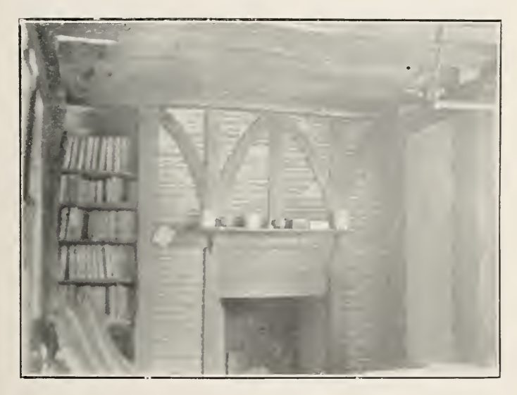
CORNER OF LIBRARY.

Just back of the library are the two kitchens, which appear to be very ancient, with a large open fire-place and brick oven, formerly used for cooking.