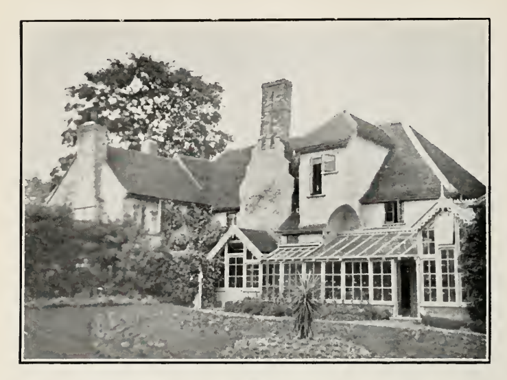
CONSERVATORY AND CHIMNEY BUILT ABOUT 1500.