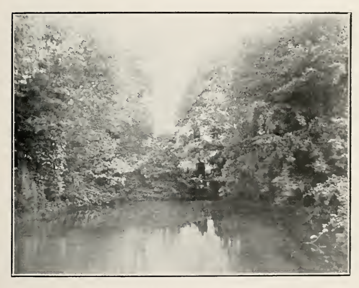
PART OF MOAT BACK OF HOUSE.

The portion of the moat remaining is situated a short distance from the rear of the house and this bit is very picturesque, with the reflection of the trees and sky on the surface of its water. This house with its moat and