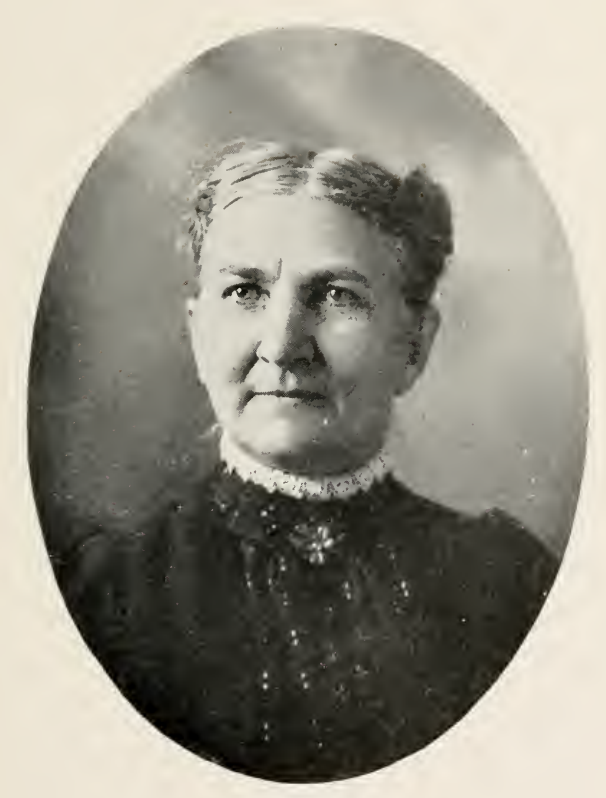
Gertude of Might-Ketcham.