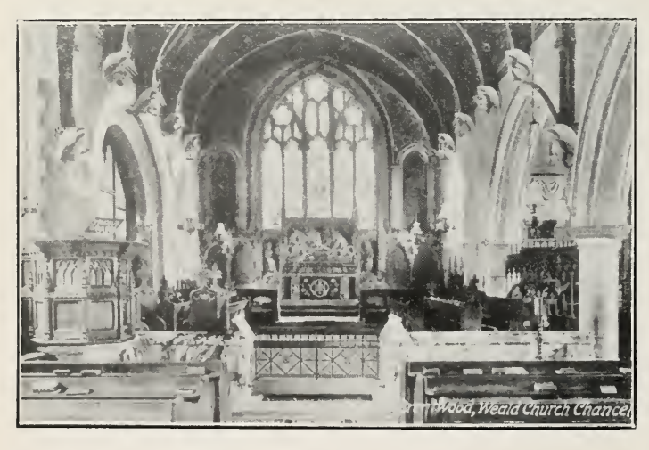
ALTAR IN ST. PETER'S CHURCH.