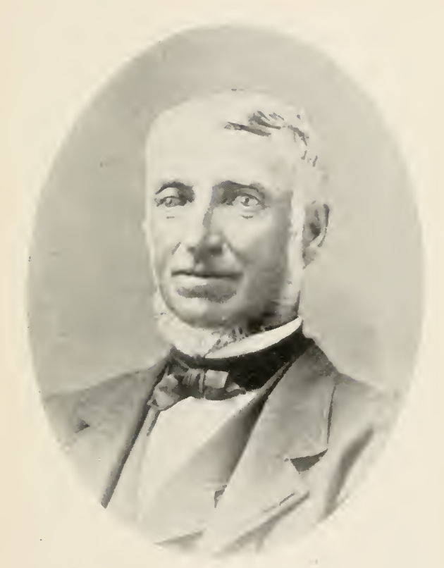
Wow of Wright.