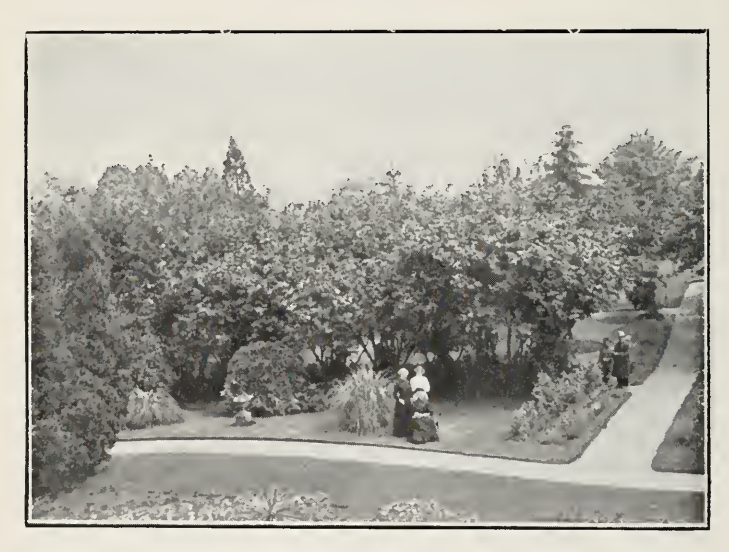
ROSE GARDEN, FROM WINDOW ON LANDING.

The house is built of brick, painted yellow; two stories, with the upper overhanging the lower. Two dormer windows are in the roof, which is covered with flat tile. Three bay-windows adorn the front with lattice work between on which vines are growing. A small porch over the front door, supported by one pillar on each side, is very quaint. A very beautiful old-fashioned brass knocker ornaments the front door.