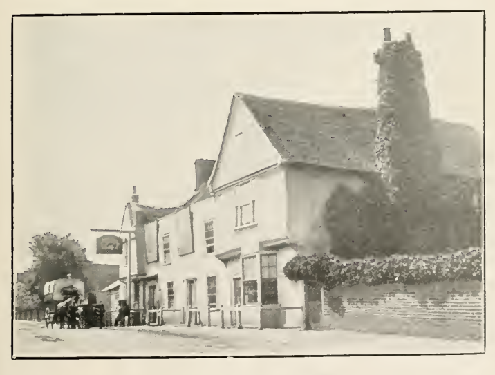
BROOK STREET WITH INN.

Brook Street is perhaps the oldest part of the parish: it takes its name from the two little rivulets, which, rising in the sandy hill above, and forming a junction at its bottom, flow into the small river of the Ingrebourne.