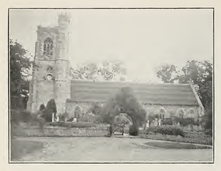
ST. PETER'S CHURCH.