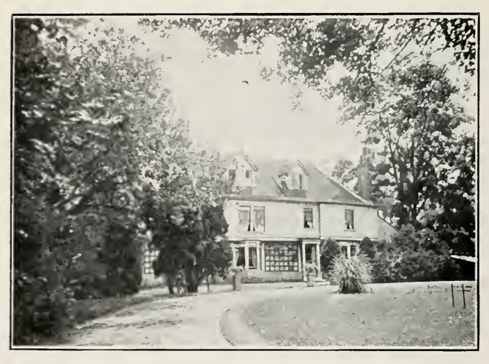
DRIVEWAY AND FRONT OF HOUSE.

There is also the Manor House, with its broad moat. It is evident that the old family of Wrights was then living in Brook Street—doubtless in the Moat House. They