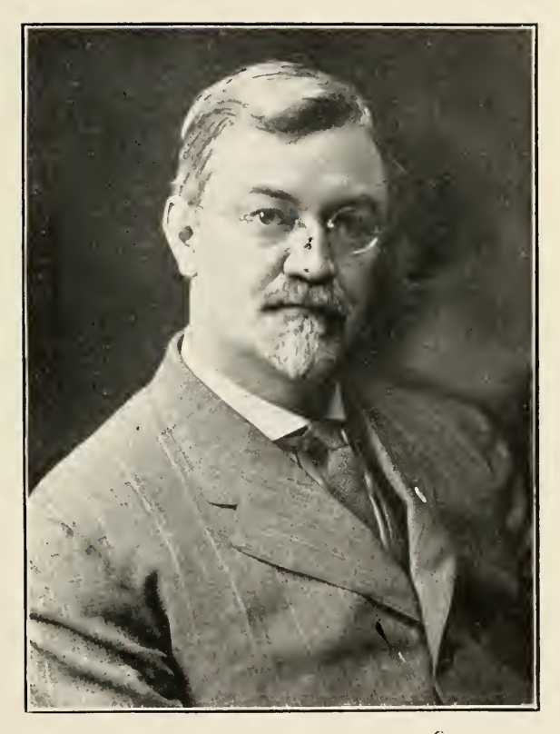
Thesen Sheer due