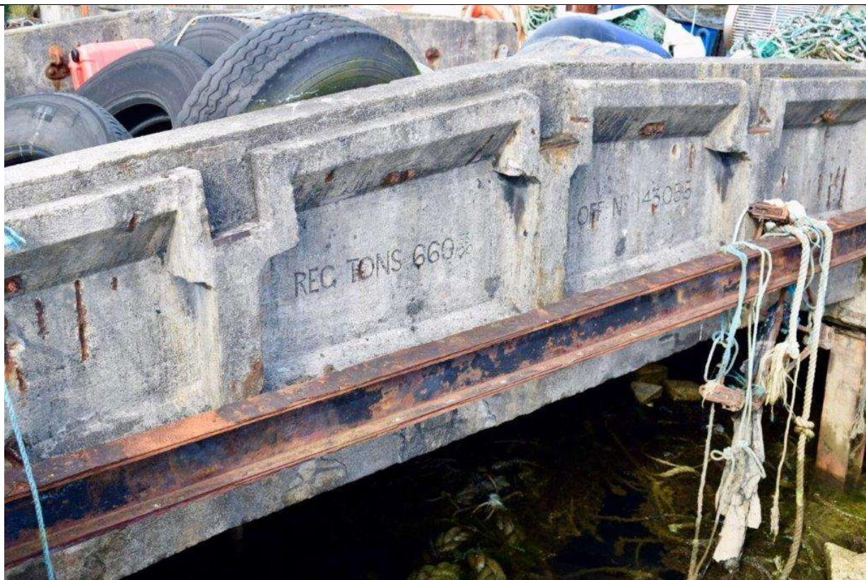
(3) Hatch Coaming – ‘REG TONS 660 58/100, and OFF No 143085’.