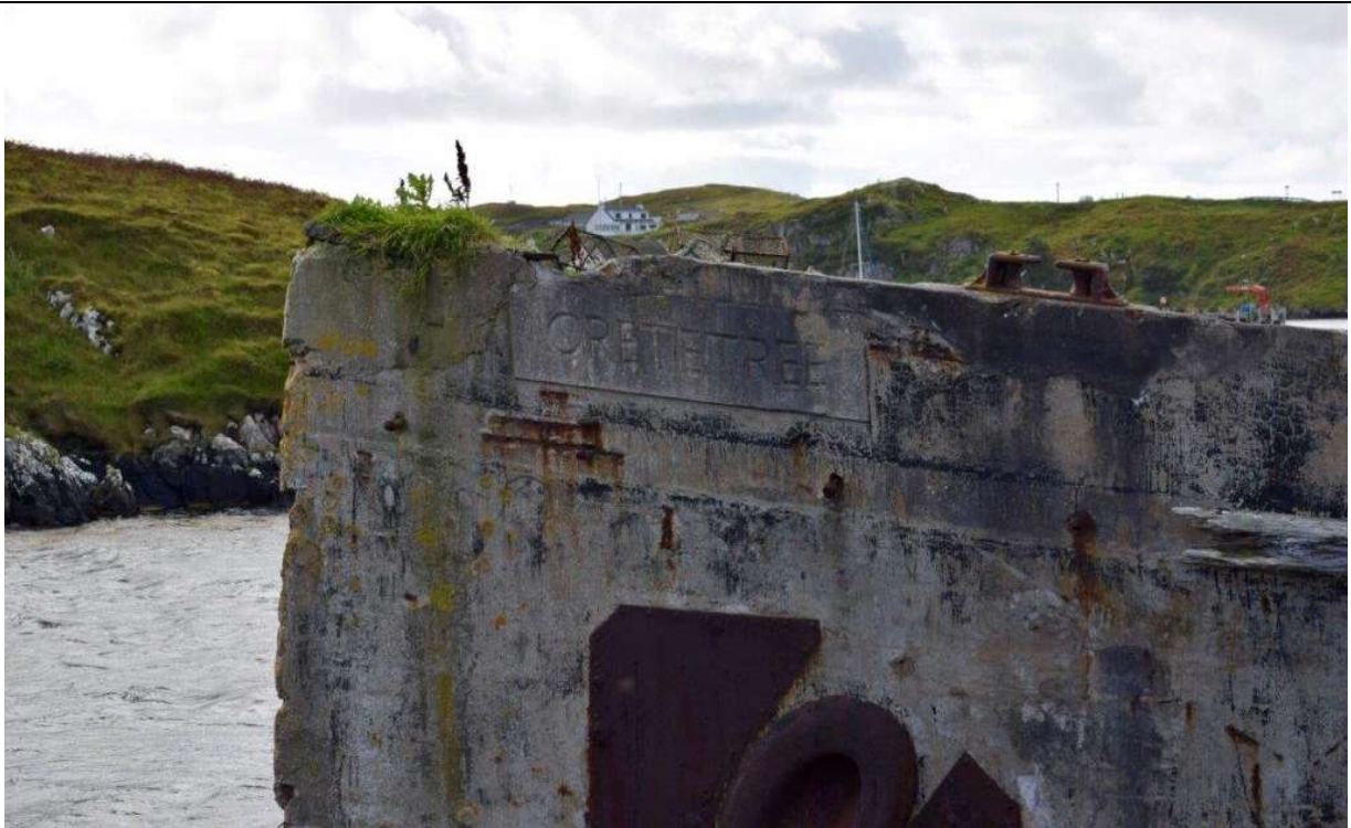
(6) Bow of the Cretetree. Note the name and the steel reinforcement around the anchor hawsepipe.