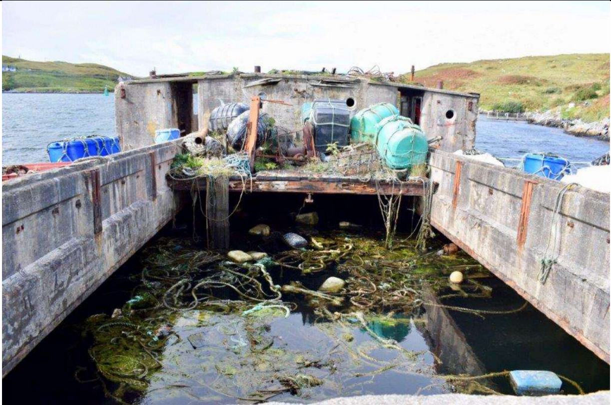
(5) Cretetree hold, full of water.