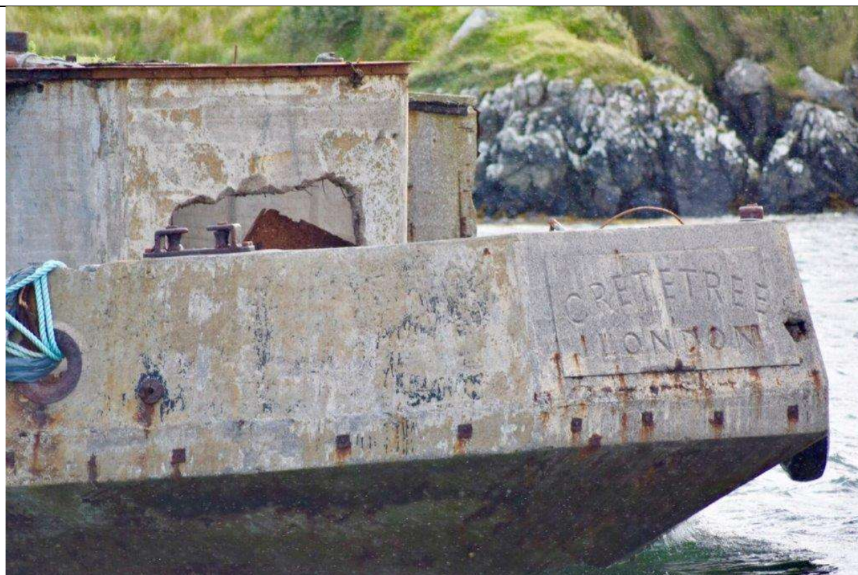
(4) Cretetree stern, ‘CRETETREE LONDON’.