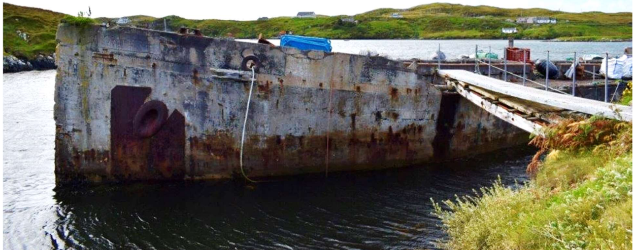
(2) Cretetree, used as a jetty.