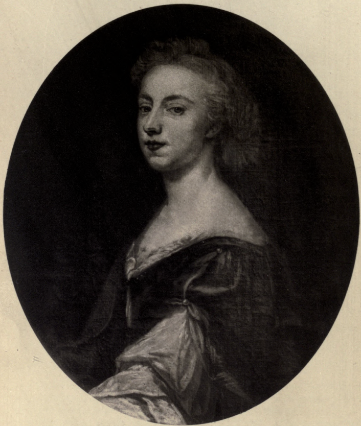
JEAN VISCOUNTESS OF DUNDEE. FROM THE PICTURE AT METHVEN CASTLE.