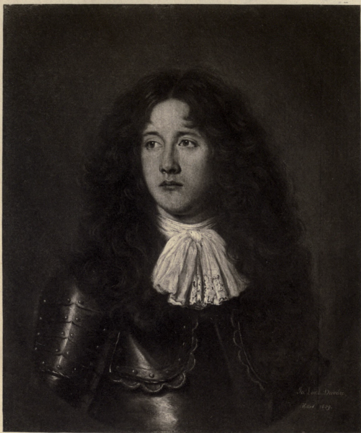
JOHN GRAHAM OF CLAVERHOUSE. FROM THE PICTURE AT MELVILLE.