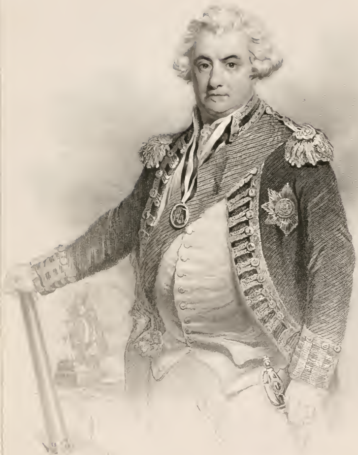
EDWARD LORD BURY.