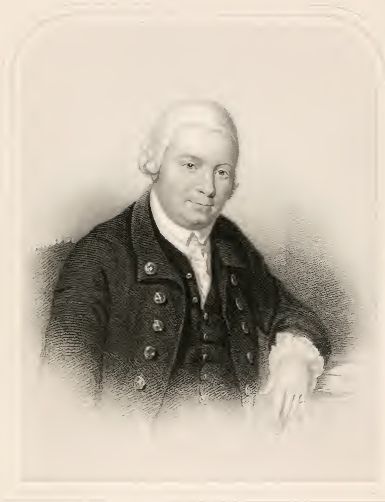
[Faint, illegible text, likely a name and title, possibly "The Hon. John ..."]