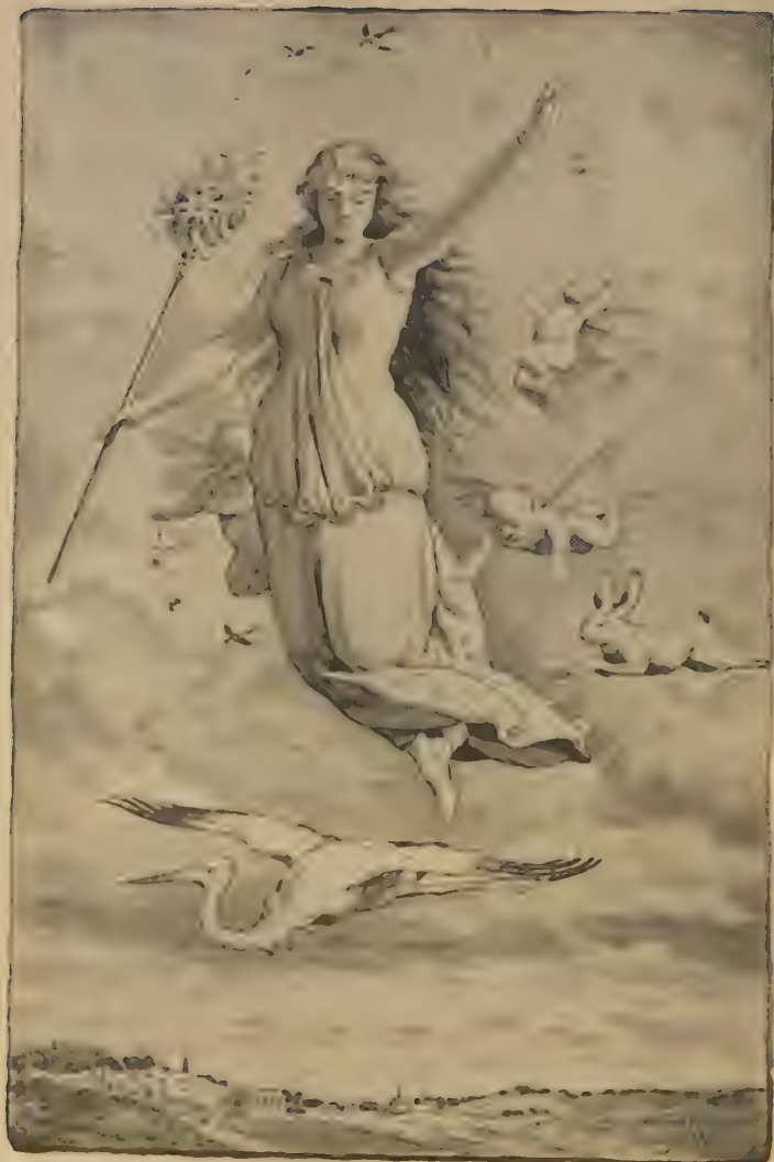
EASTRE or OSTARA