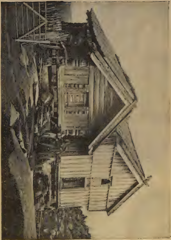
OLD HOUSES WITH CARVED DOORPOSTS, NORWAY.