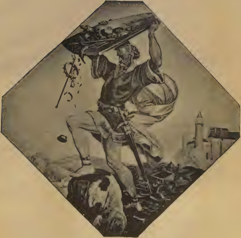
HÖGNER THROWING THE TREASURE INTO THE RHINE.— Julius Schnorr.