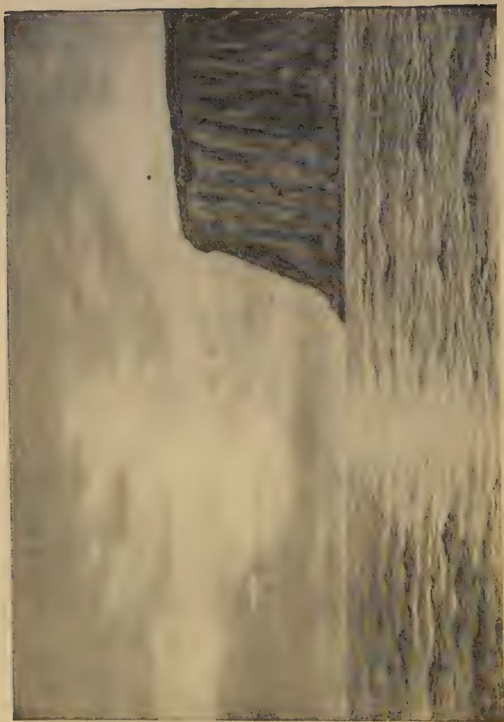
NORTH CAPE AND THE MIDNIGHT SUN