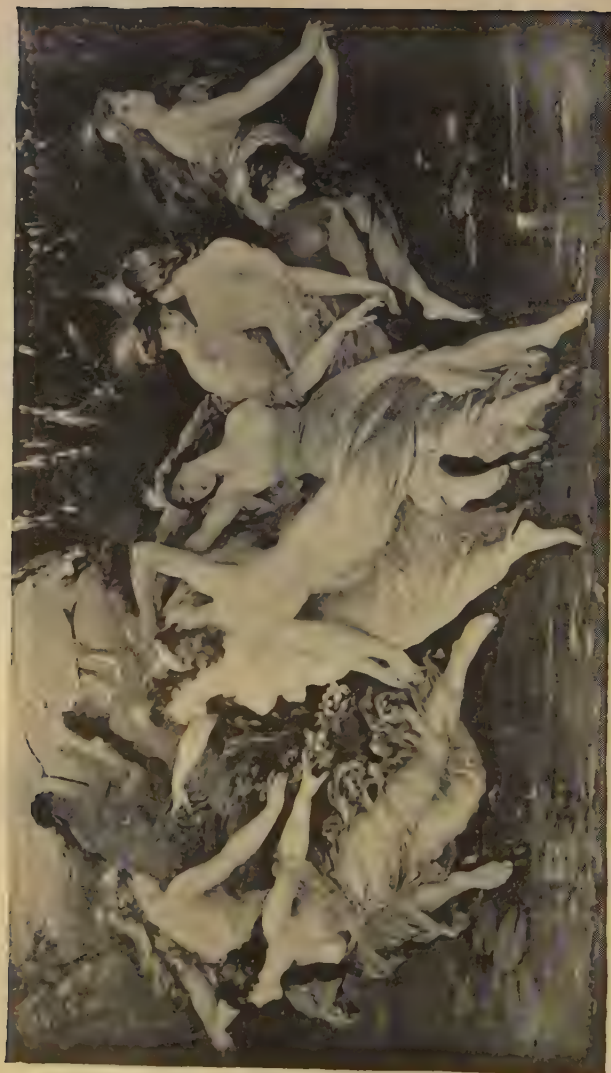
DANCE OF THE WILL-O'-THE-WISPS.—W. Kray.