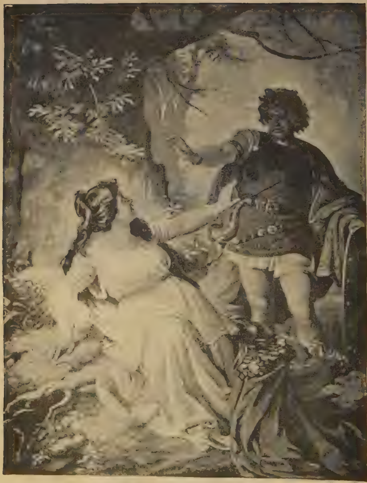
BRUNHILD'S AWAKENING.—Th. Pixis.