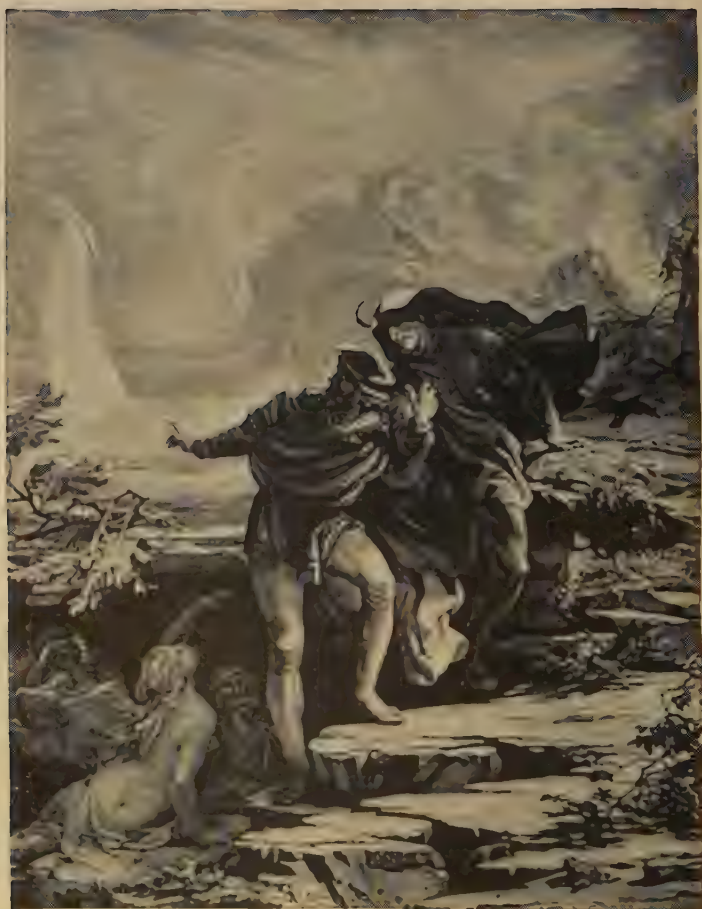
THE WITCHES' DANCE (VALPURGISNACHT) — Von Kreling.