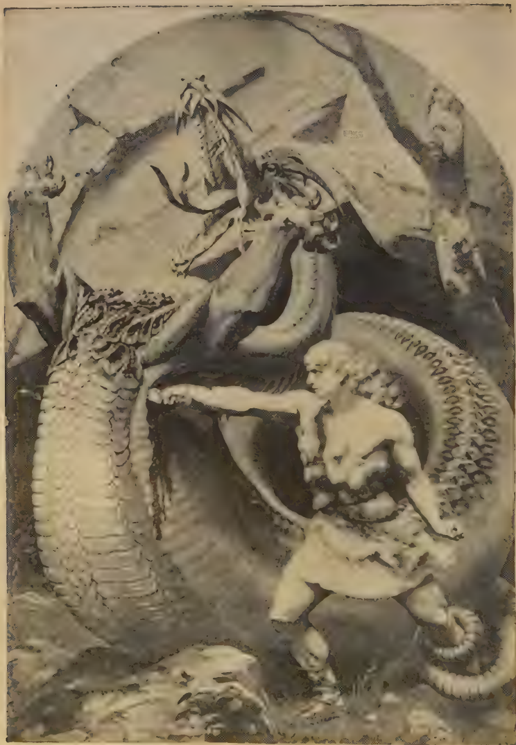
SIGURD AND THE DRAGON.—K. Dielitz.