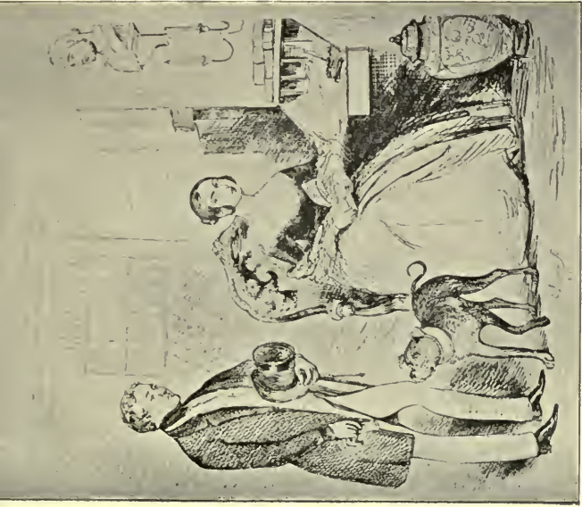
[T. Brocklebank, Esq.]

THE LETTER OF INTRODUCTION AS DRAWN BY LANDELLS FOR "PUNCH'S" PENCILINGS No. VIII.