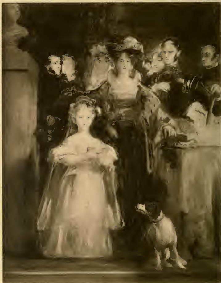
Princess Victoria with the Duchess of Kent.