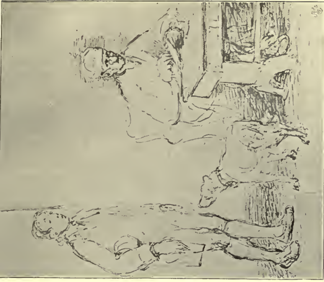
[T. Brocklebank, Esq.]

THE LETTER OF INTRODUCTION AS DRAWN BY LANDELLS FOR "PUNCH'S" PENCILINGS No. VIII.