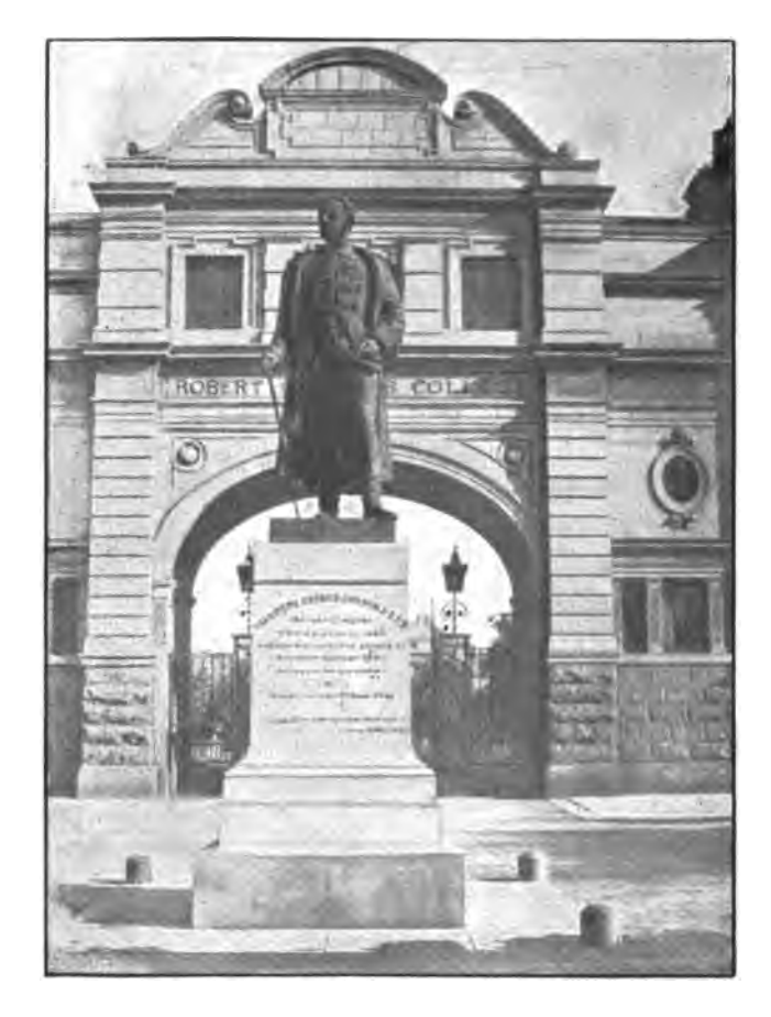
GENERAL GORDON'S STATUE, ABERDEEN.