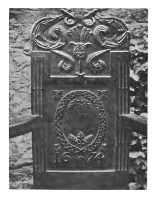
CHAIR FORMERLY USED IN ST. MACHAR CATHEDRAL.

Supplement to "Scottish Notes and Queries," May, 1899.