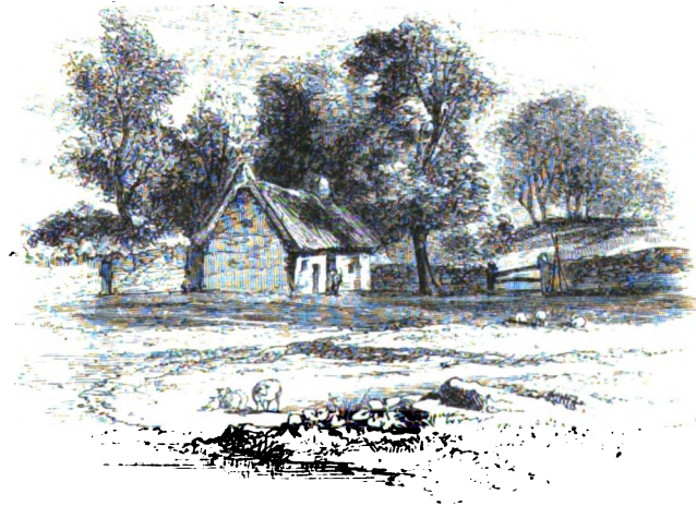
THE BLACK DWARF'S COTTAGE.