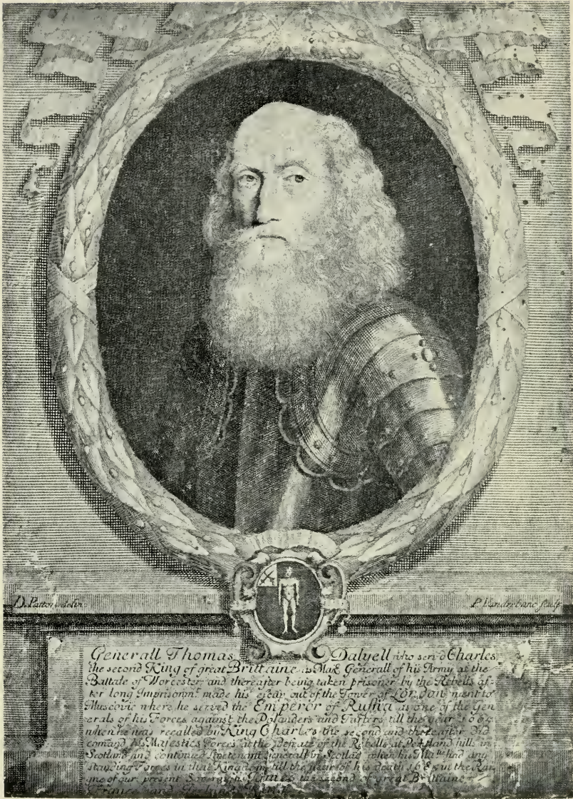
GENERAL THOMAS DALYELL OF THE BINNS