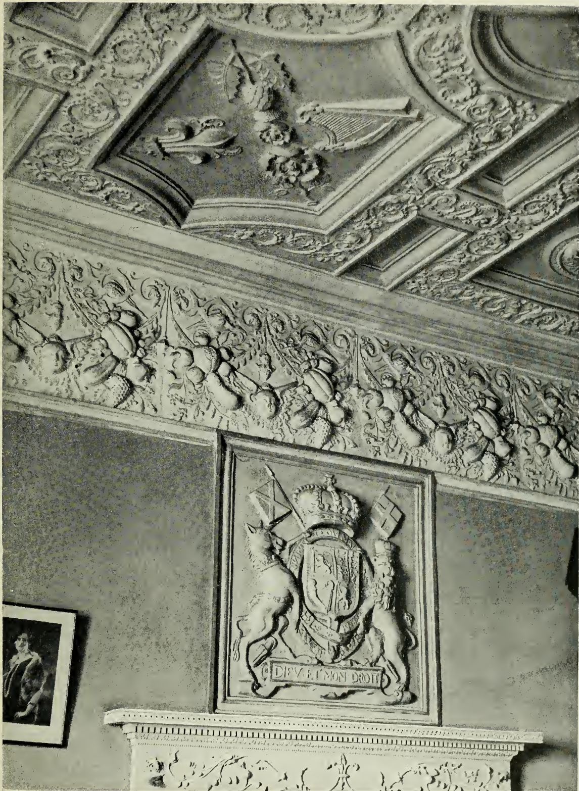
PLASTER DECORATION OF THE KING'S ROOM