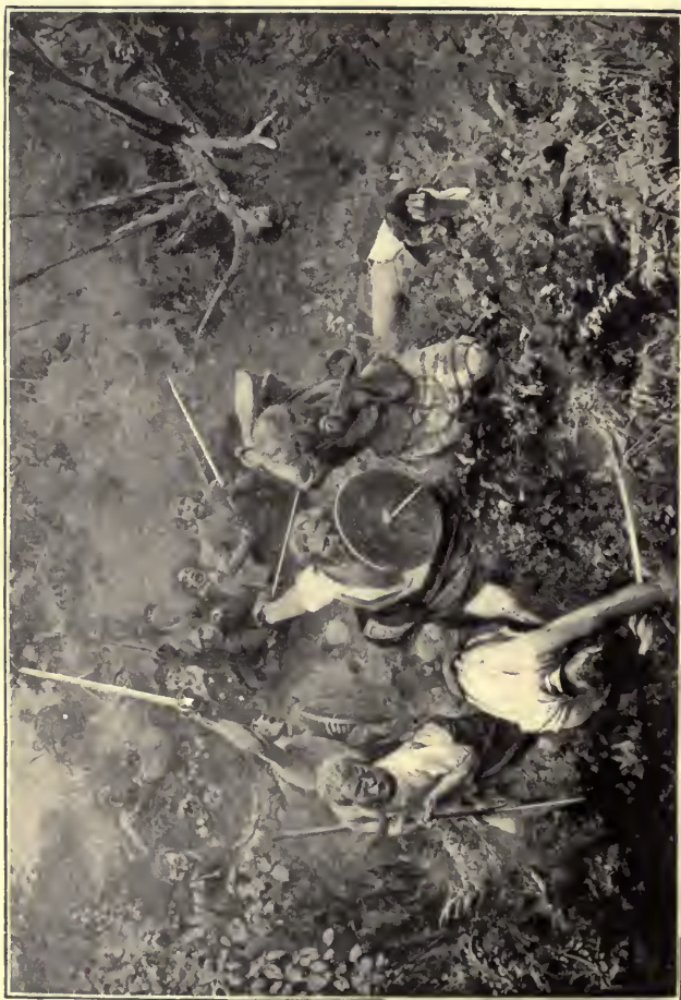
BATTLE OF BANNOCKBURN