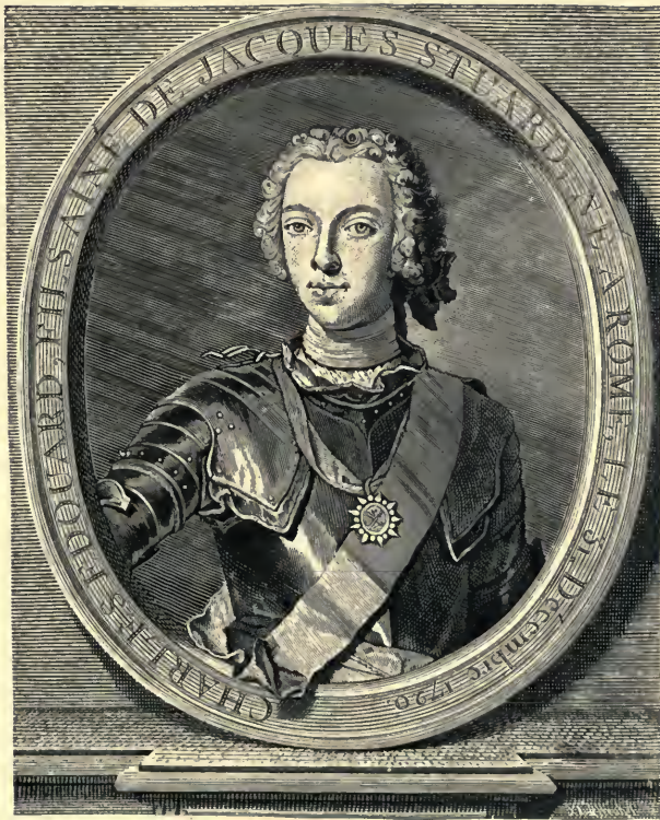
CHARLES EDWARD, THE PRETENDER