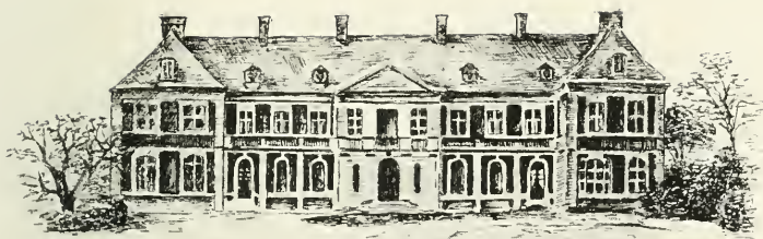
THIEPVAL CHÂTEAU BEFORE THE WAR