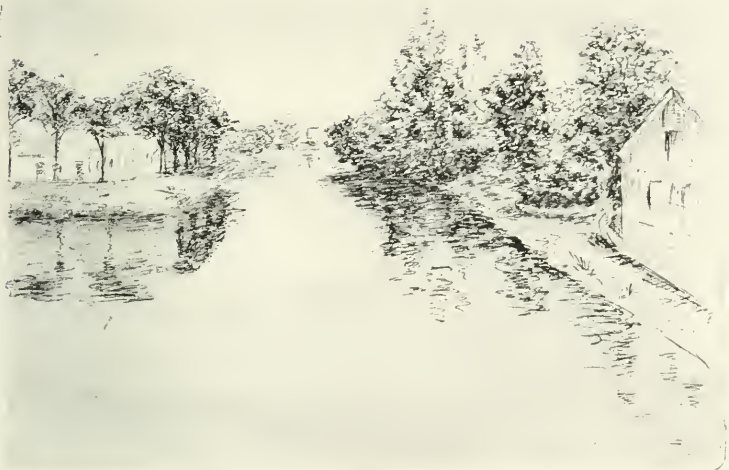
THE SOMME AT ABBEVILLE