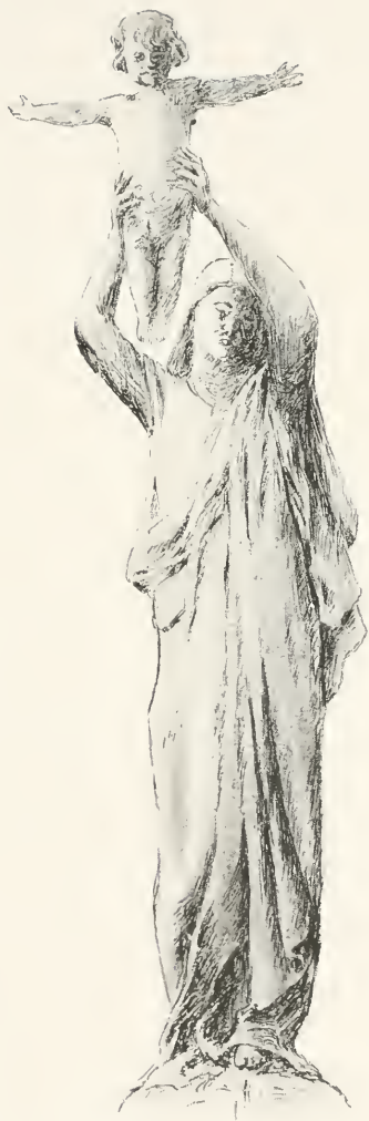
THE GILDED STATUE OF THE CAM- PANILE OF THE ÉGLISE NOTRE DAME DE BREBIERES, ALBERT