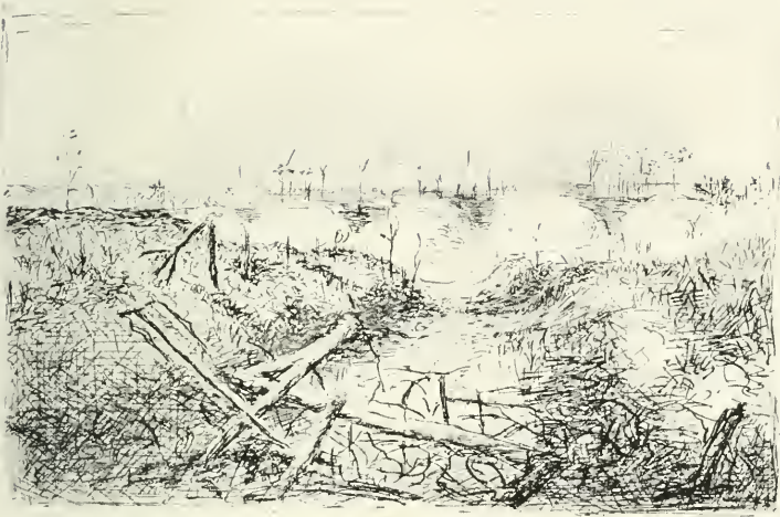
THE SMOKE OF BATTLE