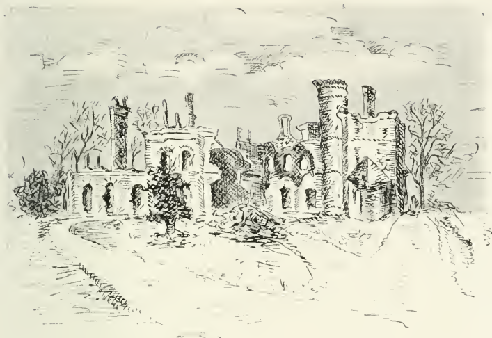
THE SPECTRAL SKELETON OF FRI- COURT CHÂTEAU, NOW A HEAP OF POWDERED BRICKS