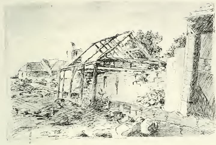
A RUINED FARMHOUSE NEAR RICHE- BOURG