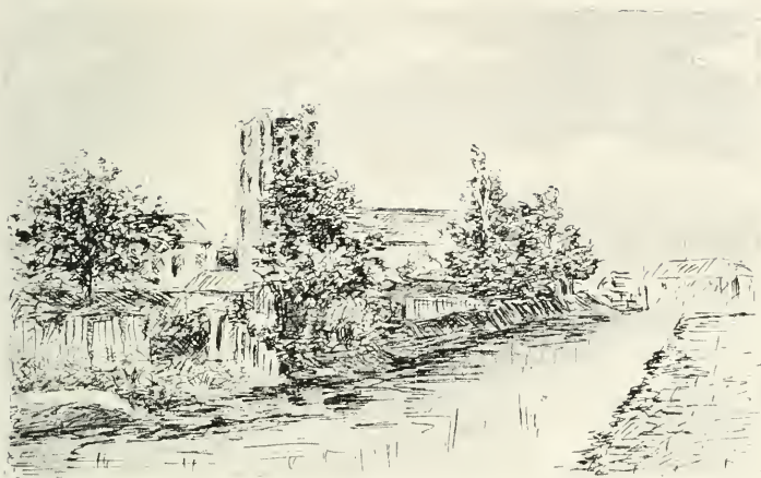
THE CHURCH OF ESTAIRES AND THE RIVER LYS