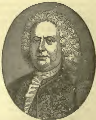
SIR WILLIAM PEPPERELL.

6. The news of this victory filled France and England with astonishment, and America with gladness. Bells were rung, bonfires blazed, and a public thanksgiving was held throughout New England. Pepperel., the commander of the land forces, was made a baronet; and the British commodore, Warren, who came to the siege unwillingly and late, was raised to the post of admiral; while Tyng, to whom belonged all the honor of the naval exploits, received the offer of post-captain in the British navy; but declining this, he had only his pay and the applause of his countrymen as his reward.