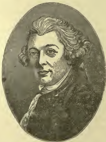
GOVERNOR THOMAS POWNAL.

Governor Pownal, for whom this town had been named, was much interested for the eastern people, so, of course, they greatly esteemed him. He was popular in Boston, too, though not a Puritan; and when he embarked for England at the close of his official term the members of the government attended him to his barge. He was afterwards a member of Parliament;