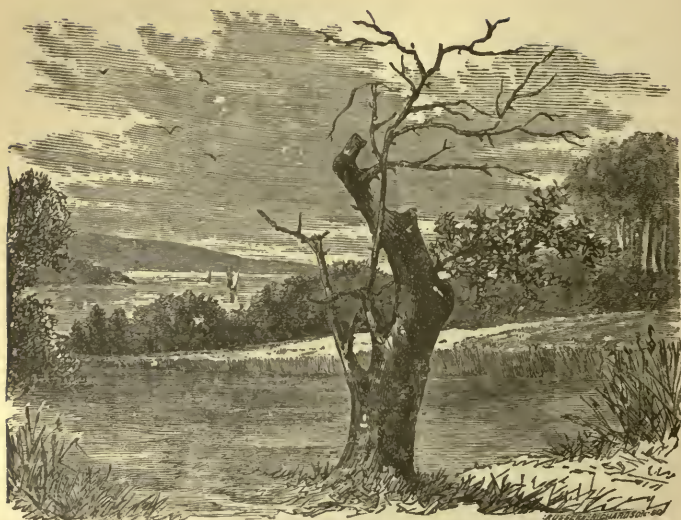
OLD APPLE TREE AT YORK, PLANTED 1629.