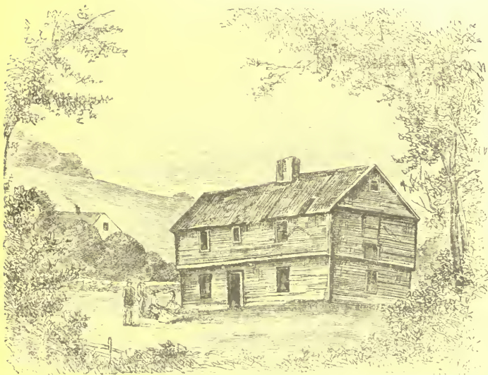
GARRISON HOUSE AT YORK, BUILT ABOUT 1645.

Early in the morning of February fifth, 1692, the inhabitants of York, while yet in their beds, heard the report of a gun. It was the Indians' signal of attack. Between two and three hundred savages, led by Frenchmen, instantly fell upon the unarmed settlers; and in half of an hour, more than a hundred and sixty of the inhabitants were helpless captives, or lay bleeding on the cold snow. There were four strongly fortified houses in the settlement, and the people who found shelter in these alone escaped; and when the savages demanded a surrender, their answer was, "Never, till we have shed the last drop of blood."