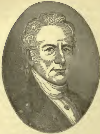
GOVERNOR WILLIAM KING.