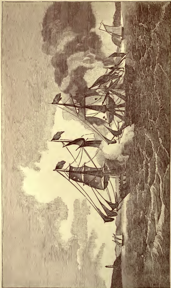
FIGHT BETWEEN THE ENTERPRISE AND BOXER, SEPT. 5, 1813.