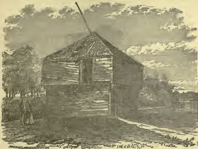
LAST BLOCK HOUSE OF FORT HALIFAX.

4. The proprietors of the Plymouth Patent had built a fort a year before at Cushnoc, (Augusta) on the eastern side of the river, which they named Fort Western. It was constructed in nearly the same manner as Fort Halifax, but was not quite so large, and had only four guns. This year the same proprietors built another within the present town of Dresden, about a mile above the northerly end of Swan Island. This they named Fort Shirley, in honor of the governor. It was formed of stockades, and enclosed a parade ground two hundred feet square, together with two block houses. Another small fort was built at the second falls of the Androscoggin, in the present town of Lisbon.