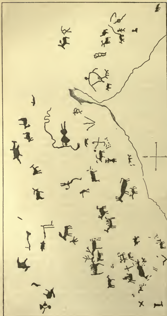
ANCIENT INDIAN INSCRIPTION AT MACHIASPORT.