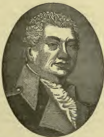
GENERAL HENRY KNOX.

friend of General Washington. When the battle of Lexington took place Henry Knox was a bookseller in Boston. He was already known to the British authorities as an active rebel, and it became dangerous for him to remain longer in the city; therefore he and his accomplished young wife fled together, with his sword hidden in her petticoat. Mrs. Knox was the daughter of the secretary of the Commonwealth; and when she married this "bookseller" her friends thought her social prospects were ruined. They made a great mistake; all through the first presidency she was in the first rank of social position, and many of her old acquaintances felt it an honor to enjoy the friendship of Lucy Knox.