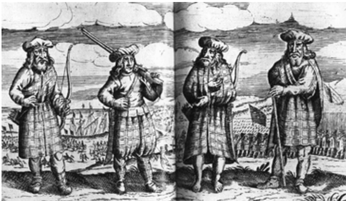
Figure 2.1 "Scottish mercenaries in the service of Gustavus Adolphus, 1631." The caption to this contemporary German broadsheet describes them as 'physically strong, enduring much: if bread be scarce, they eat roots'.

broadswords to engage in melee combat, was perfected by a brigade of Highland Scots within the Swedish army at the battle of Breitenfeld during the Thirty Years' War. 26 The Highland charge would be used by the Highland clans in all of the Jacobite Wars and later by Highland Regiments in Britain's colonial wars in British North America. In 1759 on the Plains of Abraham at the Battle of Quebec, the 78 th Fraser Highlanders delivered the coup de grace against General Montcalm's French forces with a Highland charge.