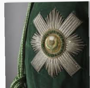
ROBE SHOWING THE ORDER OF THE THISTLE STAR BADGE. SAME MEANING AS THE WEBB HORN SYMBOLISM DOCUMENT BY GARY.