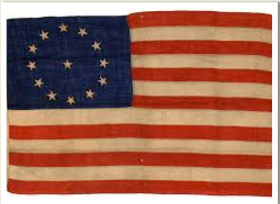
ABOVE IS A 13 STARS & STRIPES CALLED THE COWPEN'S DESIGN THAT HISTORIANS HAVE HAD NO KNOWLEDGE TO THE DESIGN ORIGINS OF THE FIELD OF STARS. THE SHIELD TO THE LEFT SHOWS THE ORIGINS OF THE DESIGN.

US Star's & Stripe's controversial flag design origins. called the "Cowpen's flag" with 12 star's in a circle & 1 in the center. Originated decades before the American Revolution, before 1745!