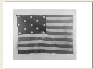
FRANCIS HOPKINSON 3-2-3-2-3 & 5 POINTED STARS SYMBOLIZE THE BONNIES JACOBITE WHITE ROSE