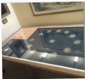
THE EASTON FLAG, 8 POINTED STARS(THISTLE STAR)OVAL MASONIC EYE(STUARTS CHARTERED FREEMASONRY)8 POINTED STARS REPRESENT THE ORDER OF THISTLE & THE STRIPES!

coat of arms of Clan Douglas. Which I wrote about this history in the Webb Horn document. Note the famous US flag in Stratford, Connecticut has the 7, red and white striped 4-5-4, stars and stripes flag. Again, the 7 stripes represents James VII & II and the Curtis, origins trace back to Stratford-on-Avon in England. Loyalists to the exiled House of Stuarts. Which US flag came first is anyones guess, but the origins are now revealed to Scottish Sovereignty.