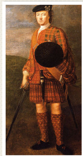
GEORGE'S FATHER, JOHN MURRAY, 1ST DUKE OF ATHOLL WAS MADE A KNIGHT OF THE ORDER THISTLE IN 1704 AND GEORGE'S MOTHER WAS THE DAUGHTER OF LORD WILLIAM DOUGLAS, 1ST EARL OF SELKIRK