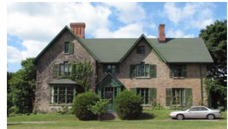
Somerset House now home for St. Alban's riding academy.

Currently a new home is being sought for this organ. If anyone is interested they may contact BPN for details.