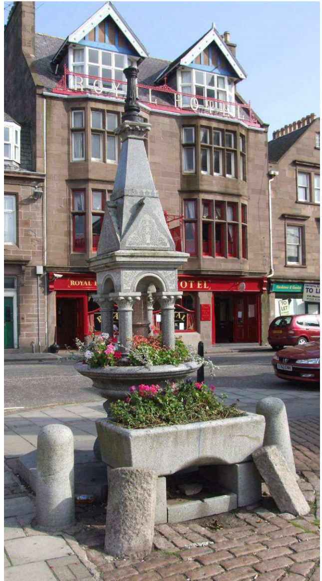
George Barrie Fountain erected in 1897.