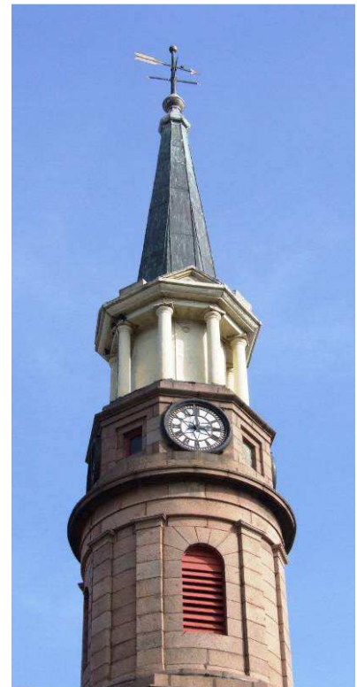
The County building (1826) 130' high clock and spire (1856/57).