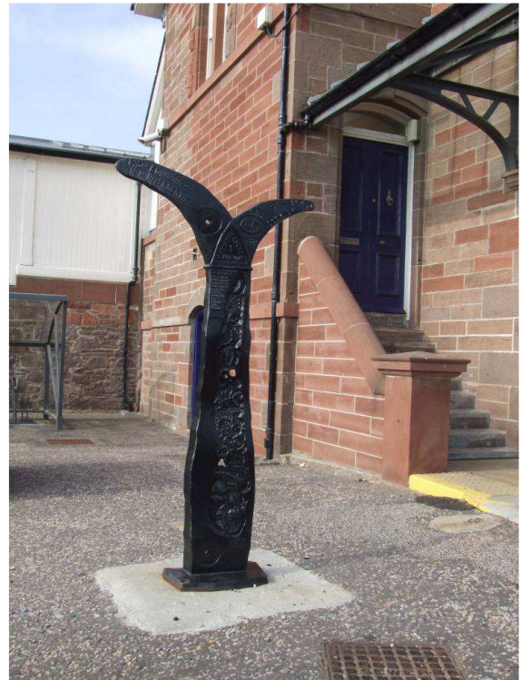
Cast iron cycle-way marker at Stonehaven Railway Station, erected in 2000 as part of a millennium cycle route project.