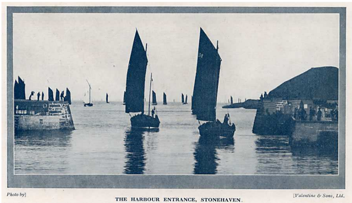
Postcard of Stonehaven Harbour by Valentine and Sons 1923.