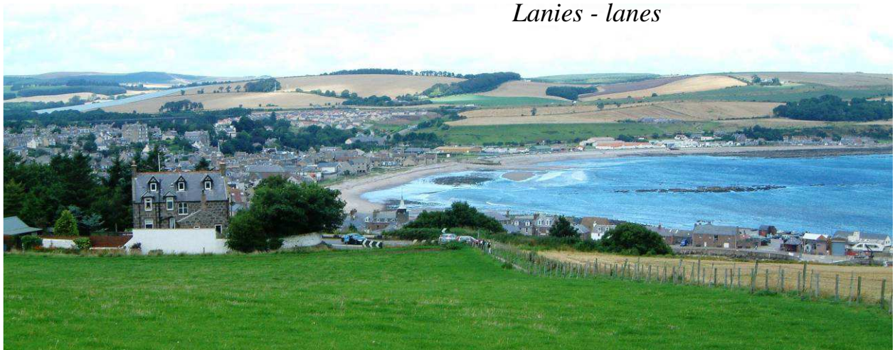
A view of Stonehaven Bay from the south.