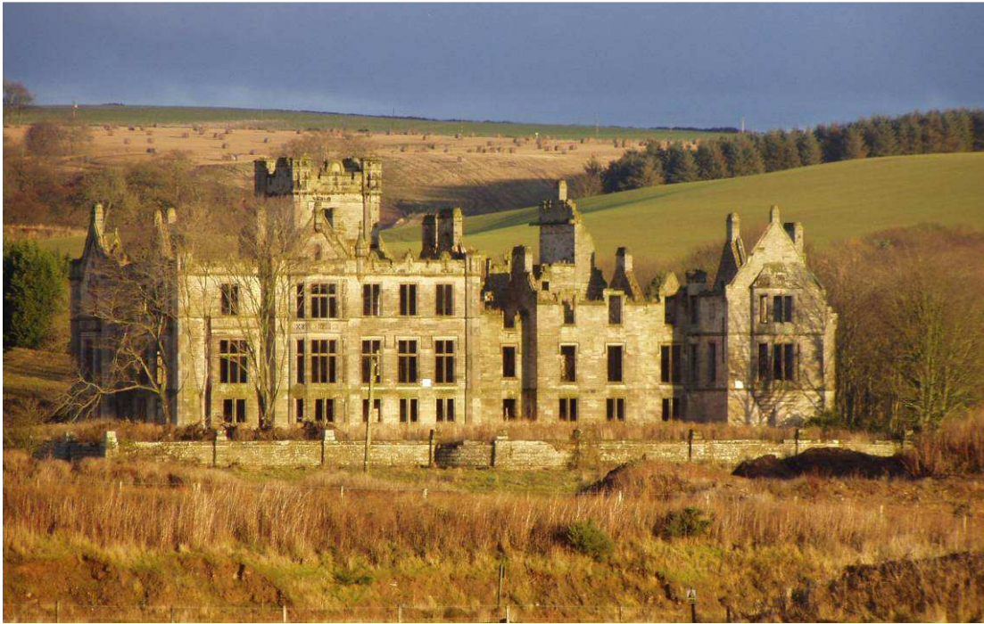
House of Ury (2005).

The impressive ruin of Dunnottar Castle was used in part of the filming of Mel Gibson's 'Hamlet'.