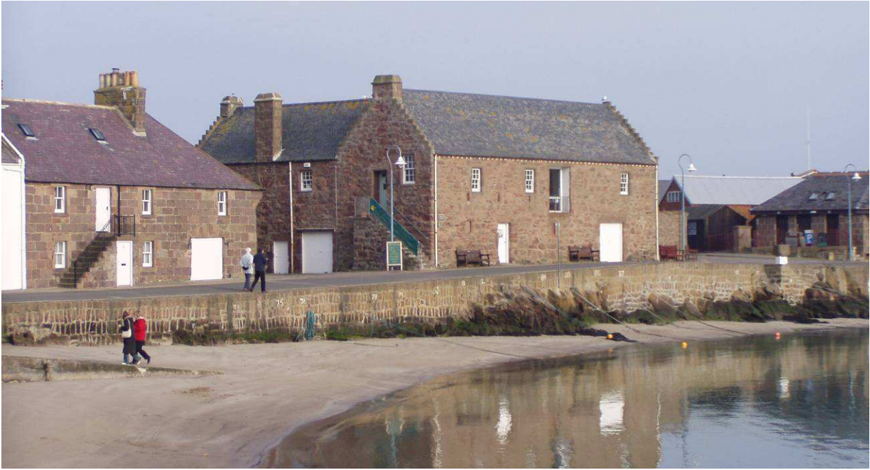
The 16 th century Tolbooth, Stonehaven Harbour.

George Keith 5 th Earl Marischal had 'Old Stonehaven' created as a burgh of barony in 1624, he also had Peterhead earlier created as a royal burgh in 1593.