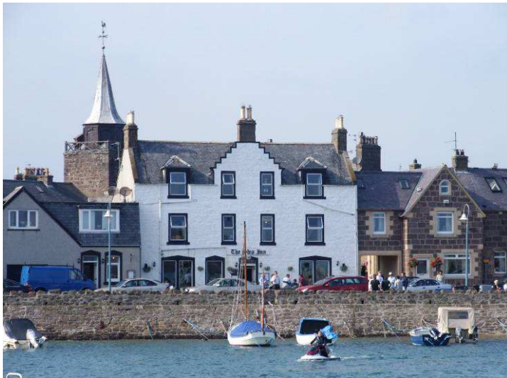
The Ship Inn Stonehaven Harbour dates from 1711.