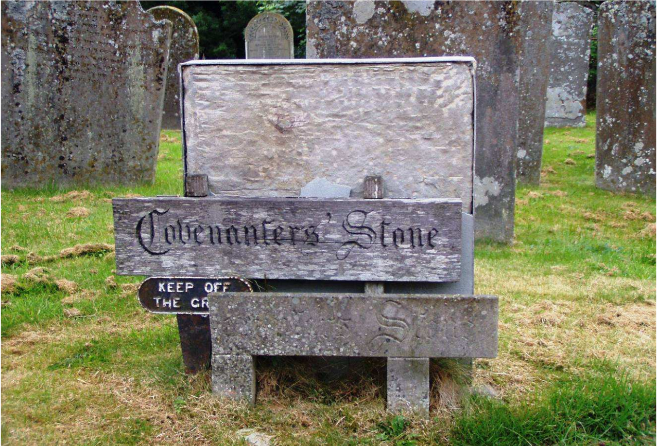
The rear of the Covenanters' Stone, Dunnottar Church, Stonehaven, Aberdeenshire.