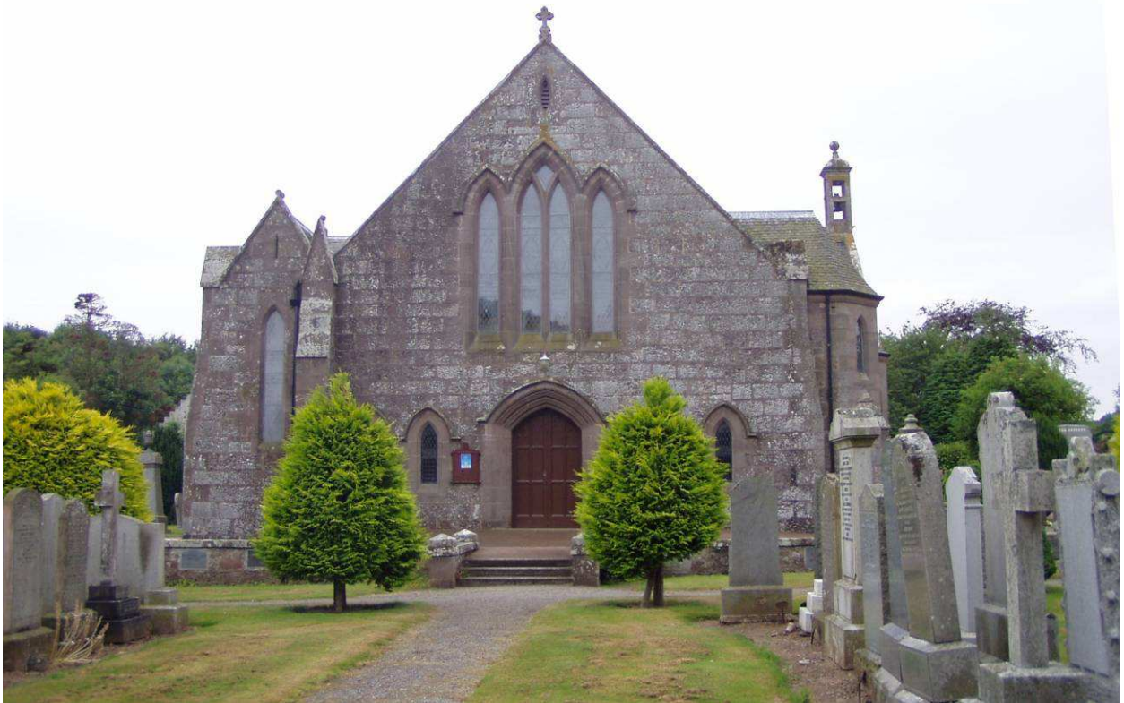
Dunnottar Church, Stonehaven.

The current church was built in 1782 and can currently seat 400 people.