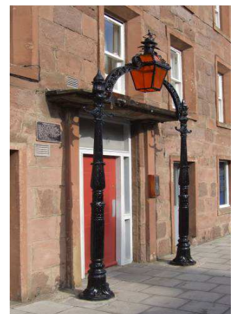
Christian's House Doorway.