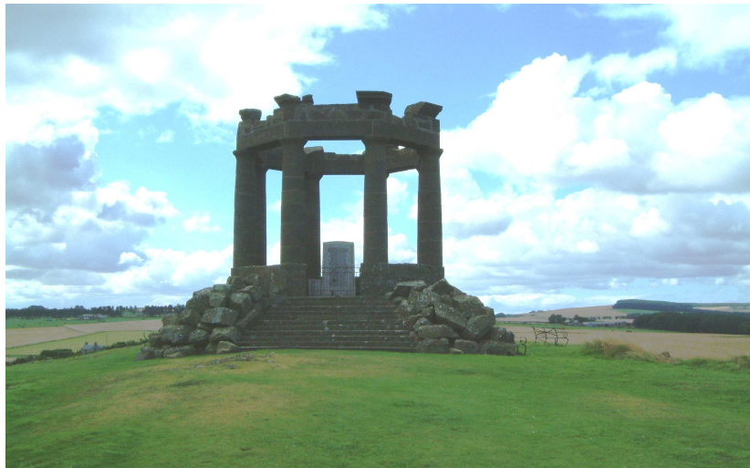
The War Memorial, Stonehaven.