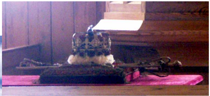
Replica crown jewels inside Kineff Church.

The jewels were returned to Charles II and taken to Edinburgh Castle in 1660. When the Scottish Parliament was dissolved in 1707 they were locked in a trunk and forgotten about until Sir Walter Scott requested a search for them in 1817, they were found in 1818 and since then they have been proudly displayed in the castle.