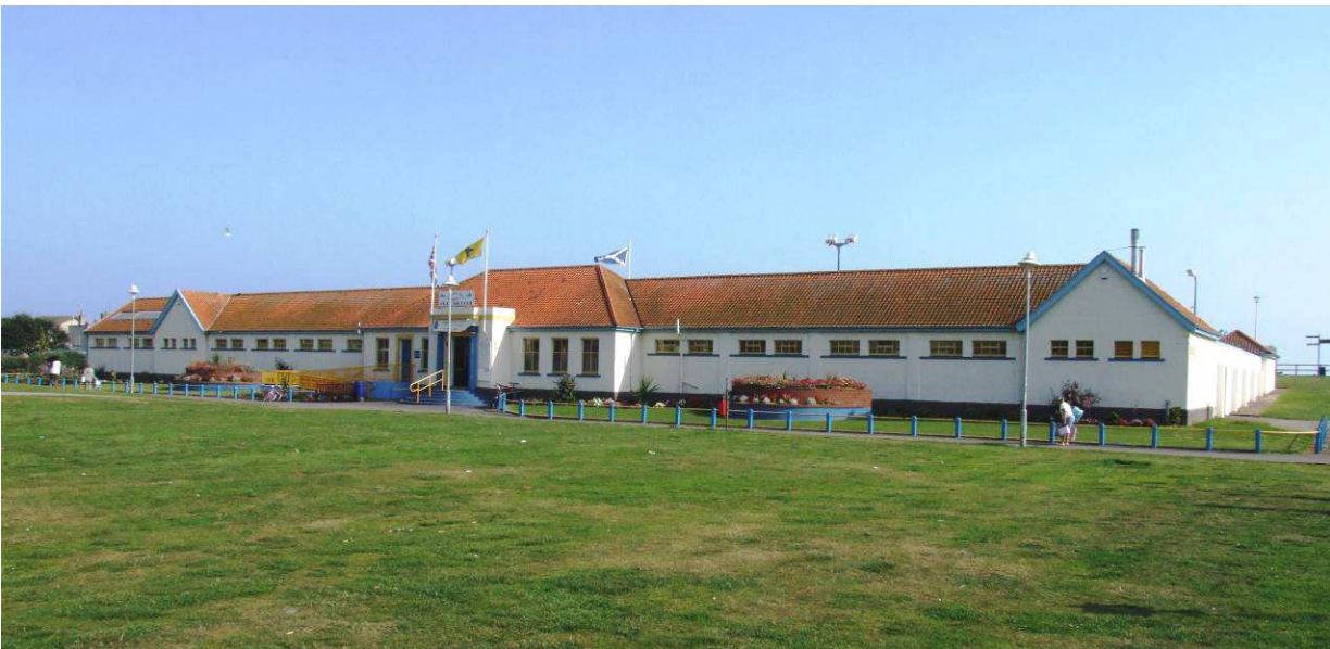
The outdoor swimming pool, Stonehaven.

We’re going doon tae Stoney, fer a dip in the pool, it’s outdoor, but it’s warm, cos it’s heated, but we a’ ken it’s cool!