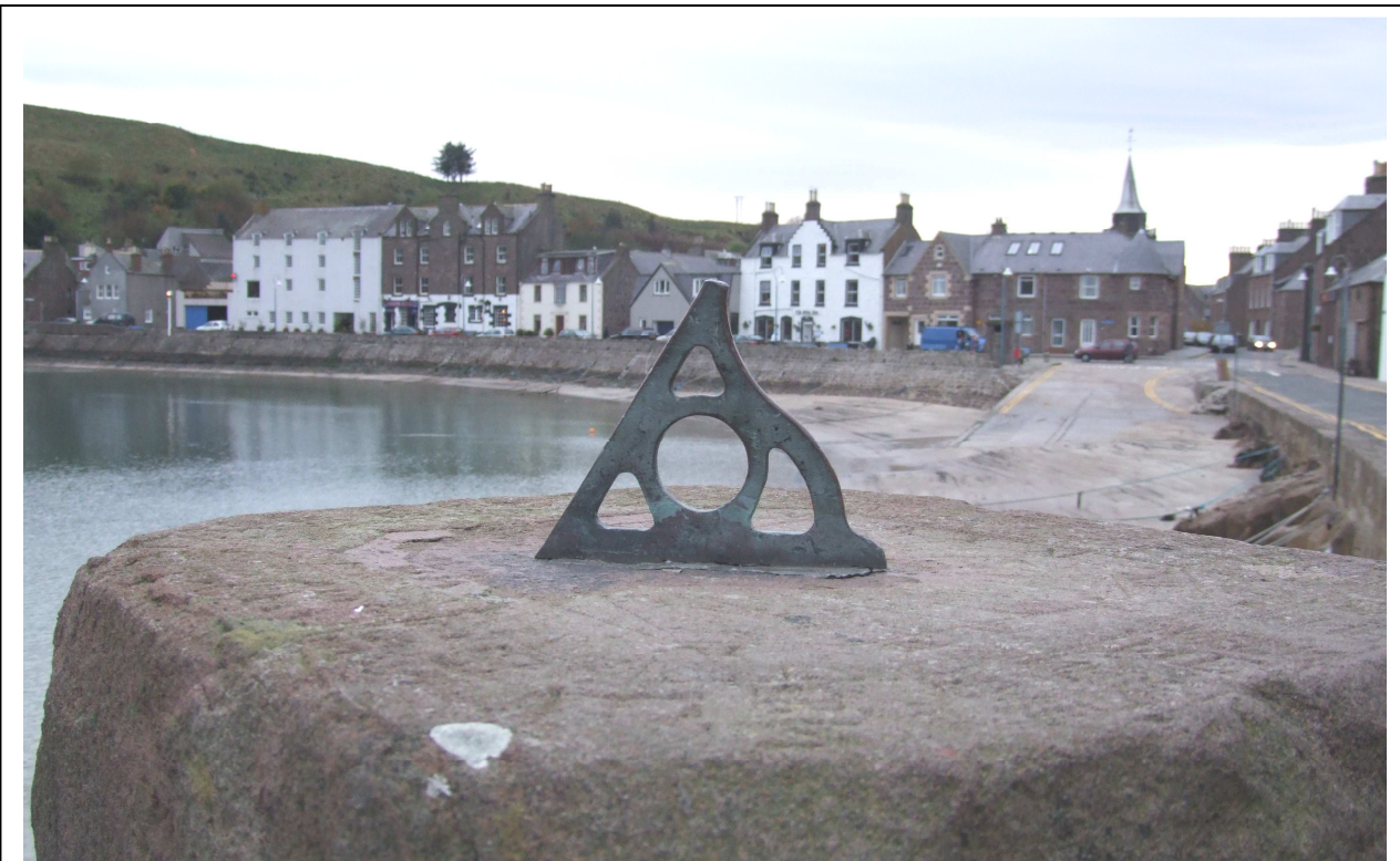
Sun dial situated at the north end of Stonehaven Harbour adjacent to the Tolbooth, it was erected in 1710.

All rights reserved. This publication may not be reproduced, stored in a retrieval system or transmitted, in any form or by any means, electronic, mechanical, photocopying or otherwise, without the prior permission of the Publisher.