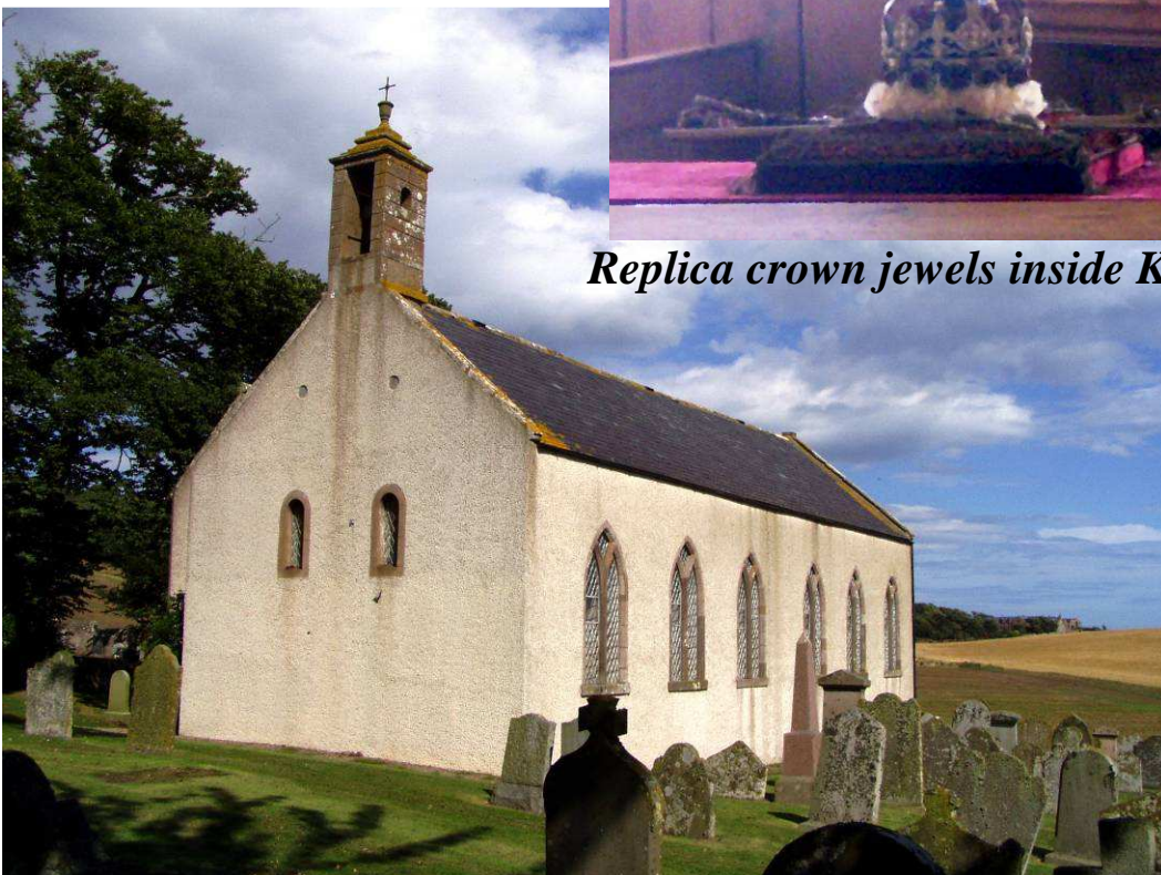
Kineff old church built in 1738. The preceding church dates back to 1242.