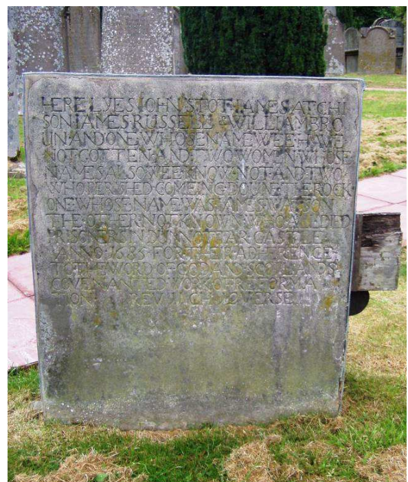
The front of the Covenanters' Stone.