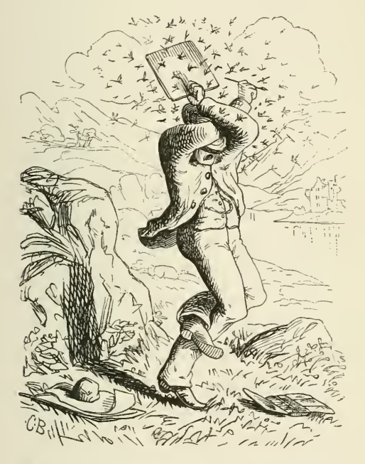
ONE OF THE PLEASURES OF MOORLAND SKETCHING.

will doubtless be called to mind, where two artists in the Highlands are thus represented with their heads wonderfully done up in gnat-defiers, in which are glazed eyelet-holes and a mouth-piece, through which a sanatory pipe may be smoked. And the present