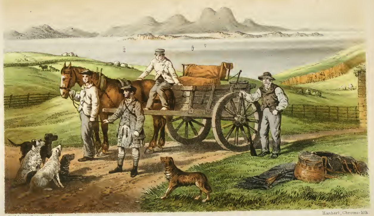
wathbort Bede, delt