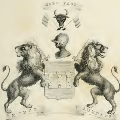
Maitland of Maitland