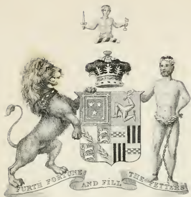
Murray Duke of Atholl