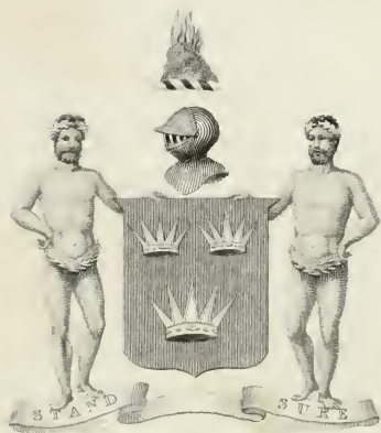
Grant of that Cl.