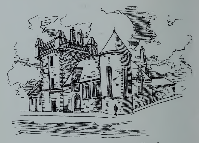
Gorbals Tower and St. Ninian's Chapel. (Page 15)