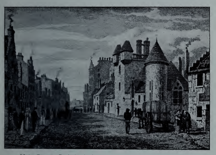
Main Street, Gorbals, looking north, at the beginning of the nineteenth century, showing mansion-house, tower, and fortalice, and the Chapel of Gorbals.