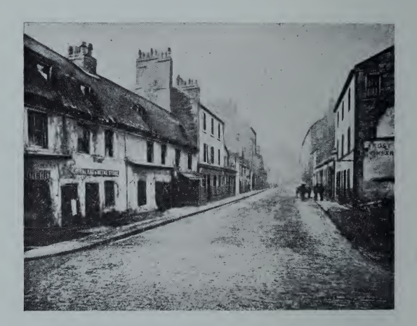
Main Street, Gorbals, looking south, 1868.