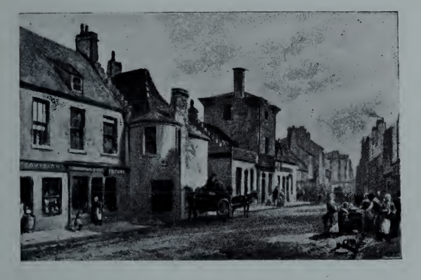
Main Street, Gorbals, looking south, showing the tower and other buildings used as a school, court-house, police office, and latterly as a public-house.