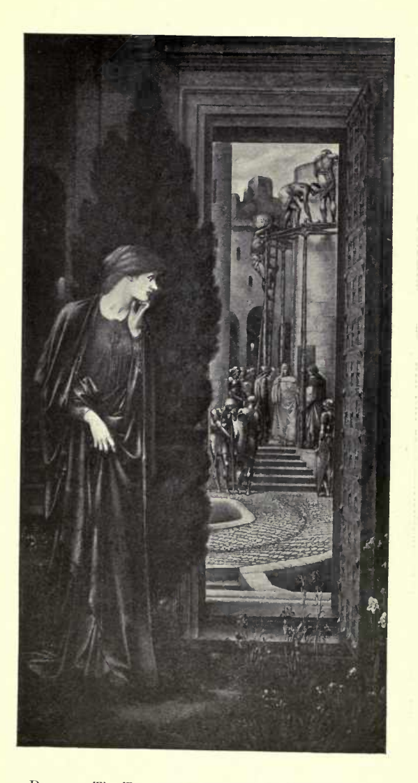
Danae or The Tower of Brass-Sir E. Burne-Jones