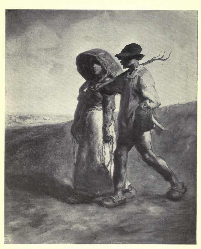
Going to Work-Jean Francois Millet