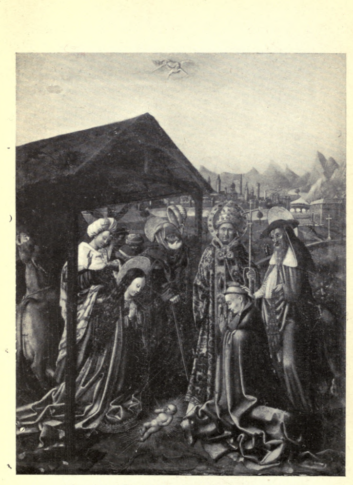
Adoration of The Magi-Antonello da Messina, 1460