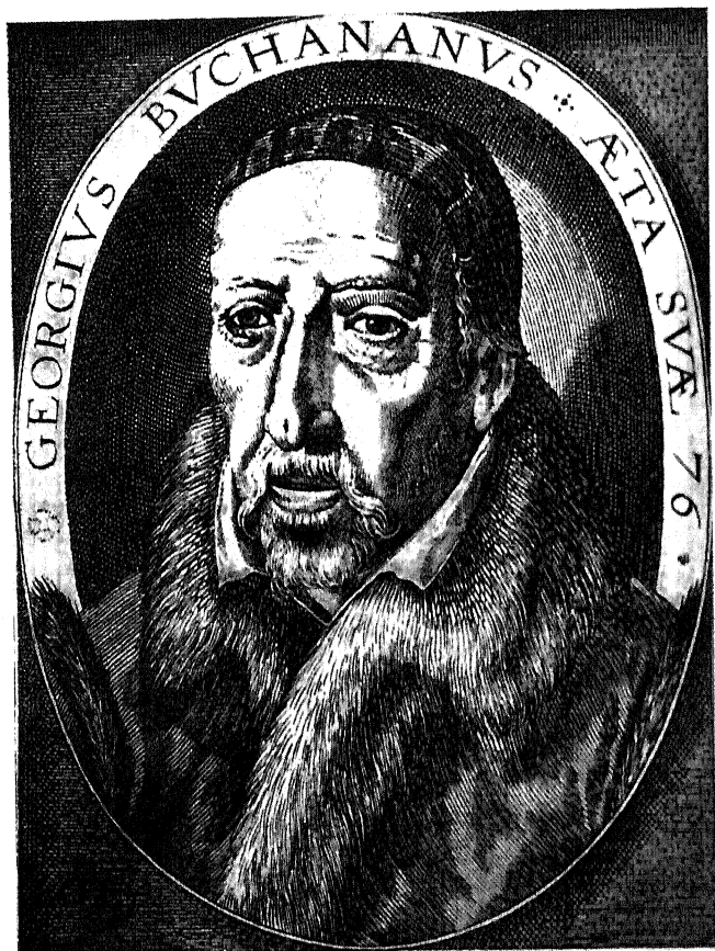
GEORGE BUCHANAN. (From Boissard.)