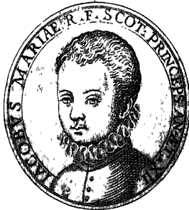
QUEEN MARY AND JAMES VI. (From Lesley's History .)