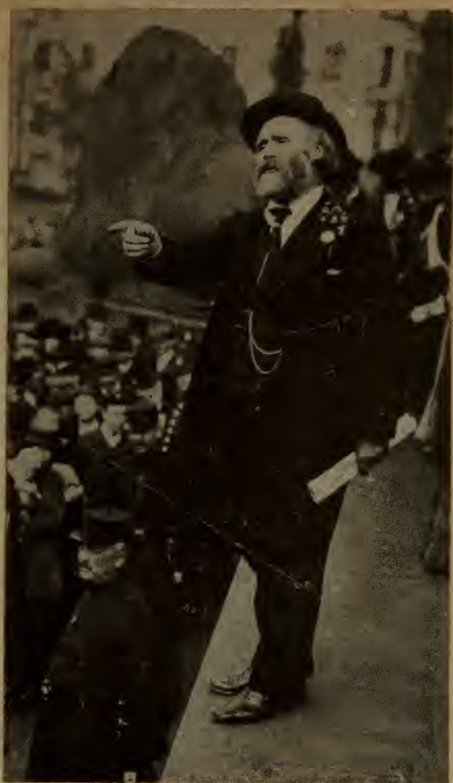
IN TRAFALGAR SQUARE.