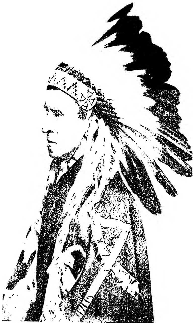
J.B., 1937, EAGLE FACE, AS A CHIEF OF THE BLOOD INDIANS