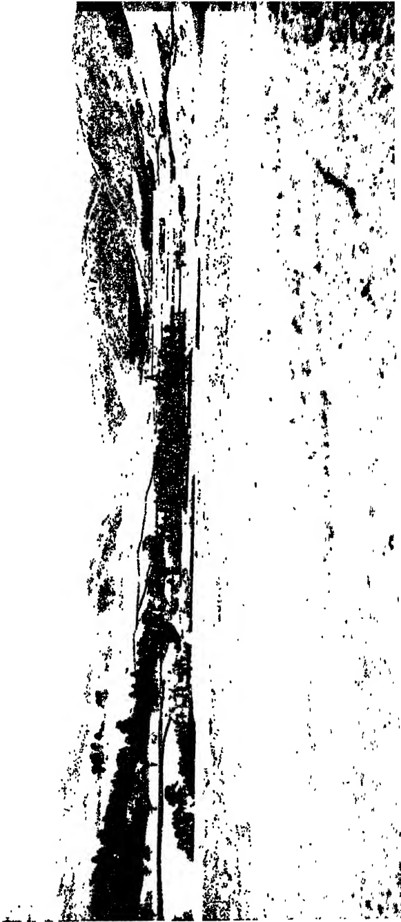
THE GATE OF TWEEDSMUIR