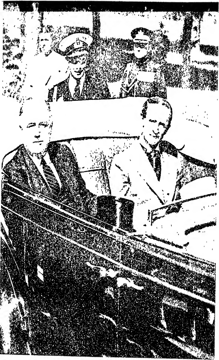
THE PRESIDENT OF THE UNITED STATES AND THE GOVERNOR-GENERAL OF CANADA QUEBEC, 1939