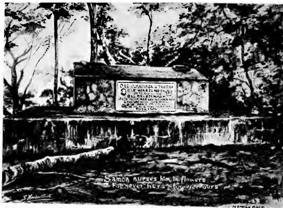
THE TOMB OF R. L. STEVENSON, MOUNT VAEA, SAMOA