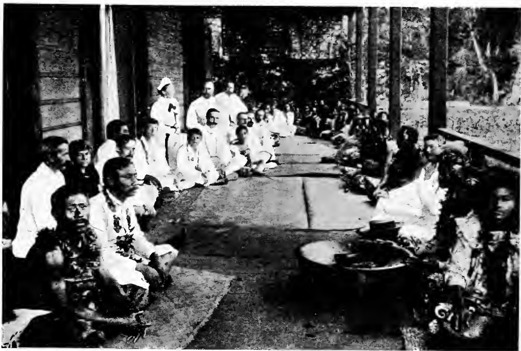
KAVA FEAST GIVEN TO THE CHIEFS ON COMPLETION OF THE ROAD OF THE LOVING HEART