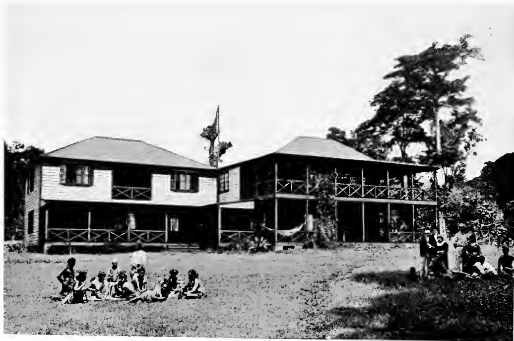
STEVENSON'S HOUSE AT VAILIMA