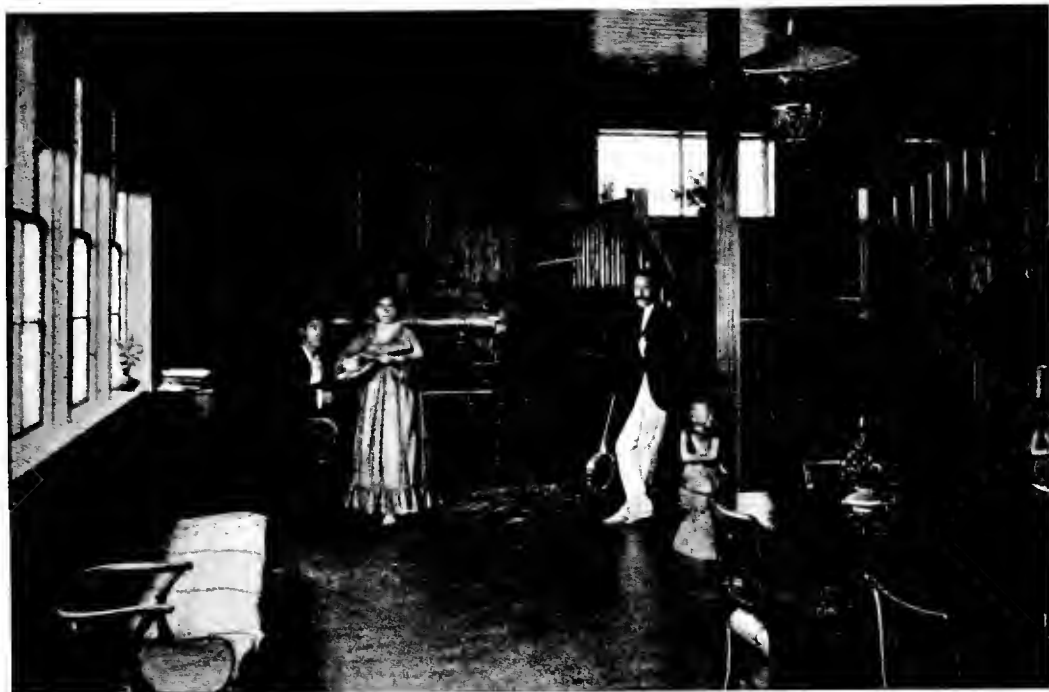
DINING AND RECEPTION HALL AT VAILIMA