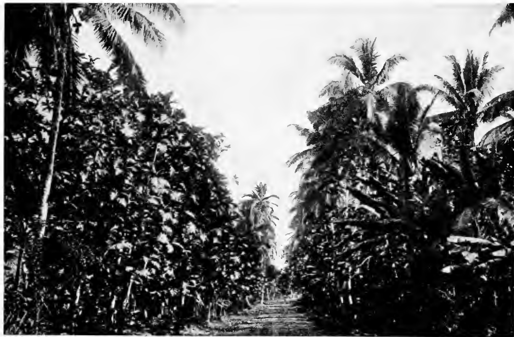
THE ROAD OF THE LOVING HEART, SAMOA