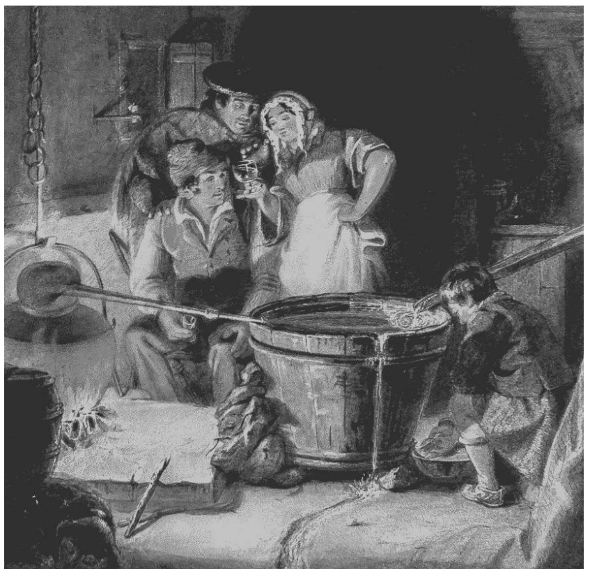
Highland Whisky Still

"A man of the Hebrides, for of the women's diet I can give no account, as soon as he appears in the morning, swallows a glass of whisky; yet they are not a drunken race, at least I never was present at much intemperance; but no man is so abstemious as to refuse the morning dram, which they call a 'skalk' (from Scots Gaelic word 'scailg' meaning literally 'a sharp blow to the head'.) The word whisky signifies water, and is applied by way of eminence to strong water, or distilled liquor. The spirit drunk in the North is drawn from barley. I never tasted it, except once for experiment at the inn in Inverary when I thought it preferable to any English malt brandy. It was strong, but not pungent, and was free from the empyreumatic taste or smell. What was the process I had no opportunity of inquiring, nor do I wish to improve the art of making poison pleasant."