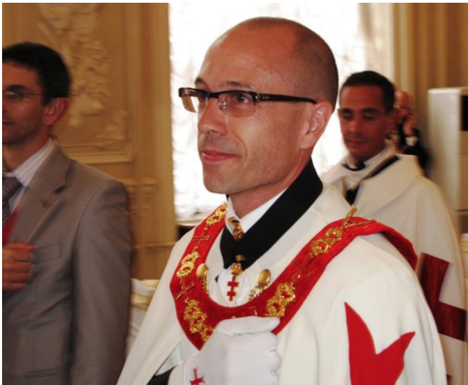
June 2012, Saint Petersburg International induction chapter.