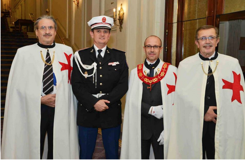
November 2013, Monte Carlo IPA evening at The Hôtel de Paris.