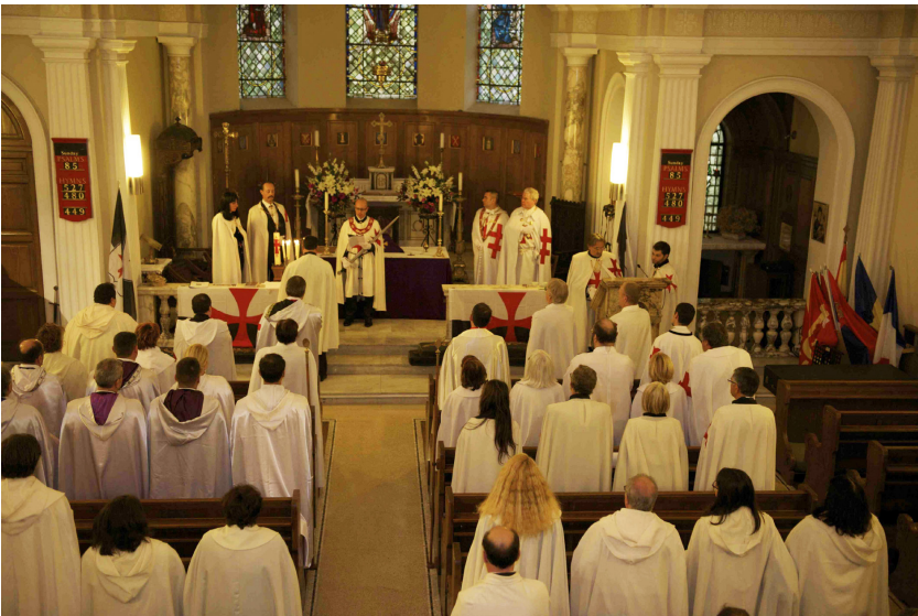
December 2014, Monaco International Priests Induction Ceremony.