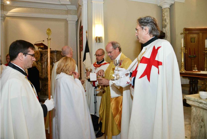
December 2013, the ceremony of the International convocation of priests in Monaco.