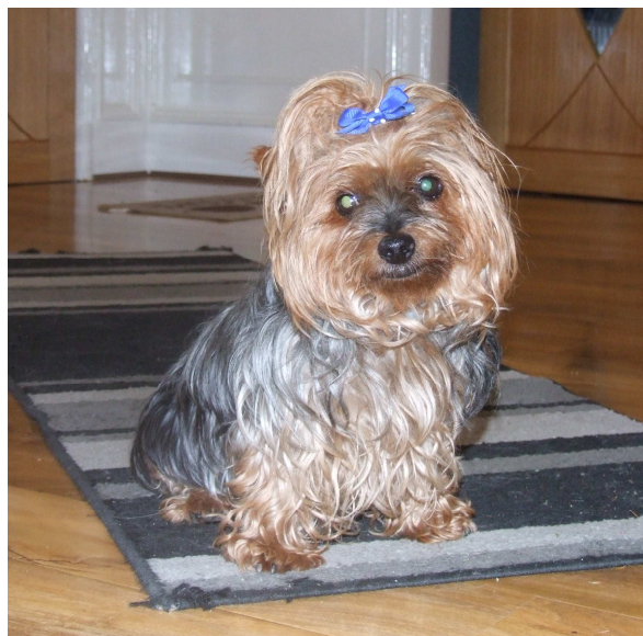
Holly, 25 Dec. 2010 to 11 March 2021.