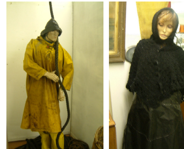
Fisherman and fishwife (2004).