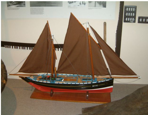
Zulu sailing boat (2004).