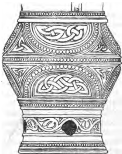
Fig. 5. Socket of St Fillan's Crozier. (Actual size.)

Like progressive additions and adaptations can be traced in many of the more celebrated of the Irish relics of a like character with the Quigrich. The late Dr Petrie,—whose knowledge of the history and art of such objects was the result of a lifelong study,—on the occasion of the exhibi-