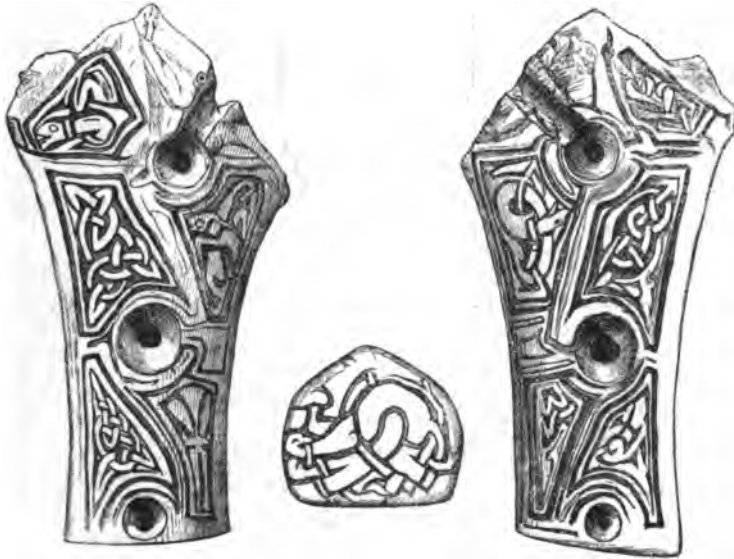
Fig. 2. Front part of Bronze Crozier found at Hoddam Church, Dumfriesshire. (Actual size.)