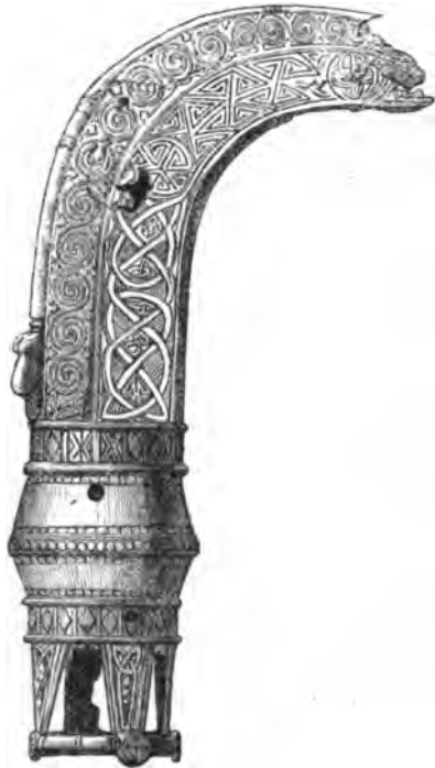
Fig. 1. Bronze Crozier in the Museum (Bell Collection). 7½ inches high.

Examples of this style occur in the ancient Irish crozier (fig. 1) which formed part of the Bell collection, and is now in the Museum, as well as in the front part of another Celtic crozier of early date in the Museum (fig. 2), of which the history is not known further than that it formed