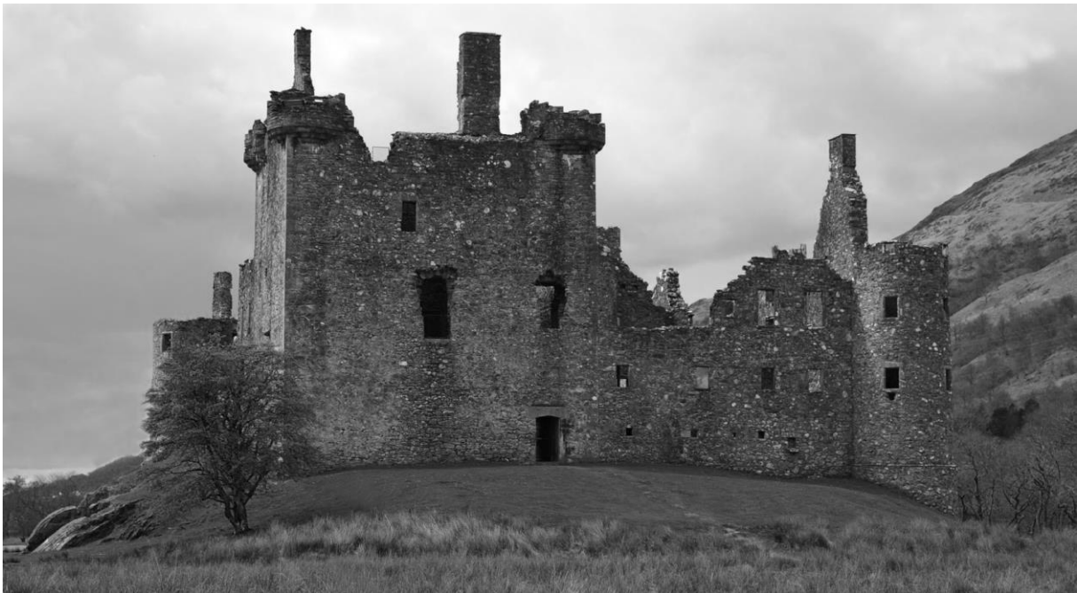
Kilchurn Castle, Loch Awe, Argyll, strategically placed at the foot of of Ben Cruachan. One of the most formidable Government strongholds in the Highlands, It cast a long shadow over Macintyre country and well beyond