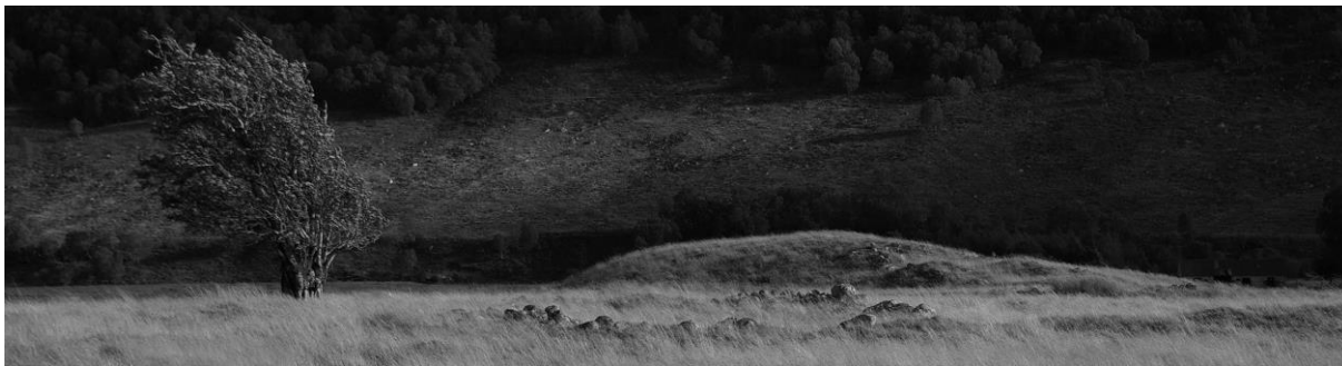
Ruins from one of the townships in Glen Banchor, Badenoch, torched by vengeful Government troops after Culloden. The ancient guardian rowan tree, a feature of the Highland clachan, stands as a mute witness to the painful aftermath of the Rising