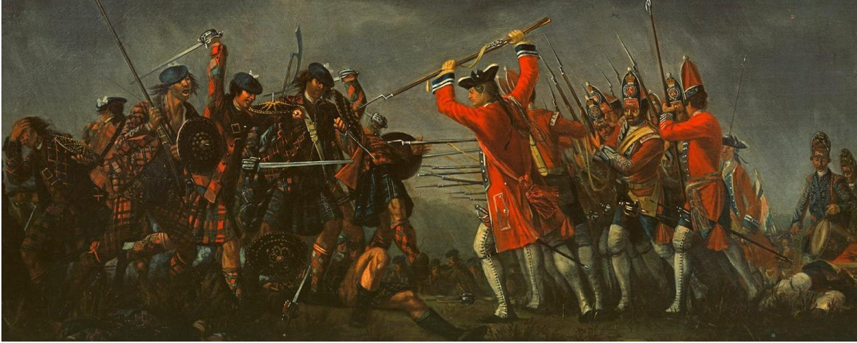
Detail from An Incident in the Rebellion of 1745 by David Morier