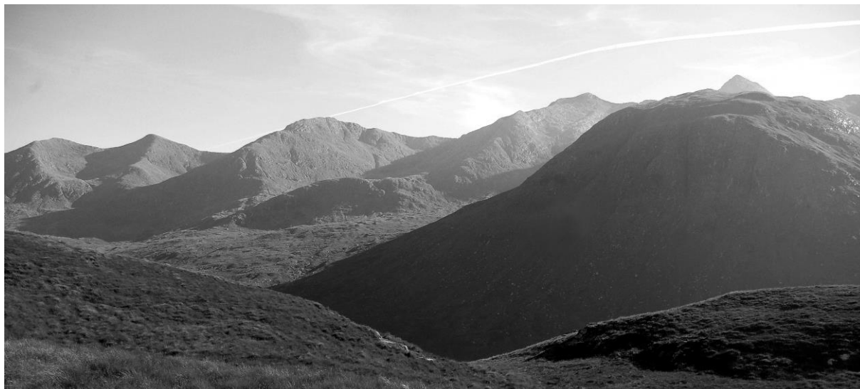
The majestic north wall of Ben Cruachan, defining the southern edge of Glenoe. From left to right: Sron an Isean; Stob Diamh; Drochaid Ghlas; Cruachan Summit; and Stob Dearg. In the foreground, in heavy shade, is Meall Riaghain

hundred men inside the castle, and as many, by his own reckoning, close by - was calculated to 'convince the McIntyres that His Majesty's Troops must not be (further) Marther'd or Affronted' .