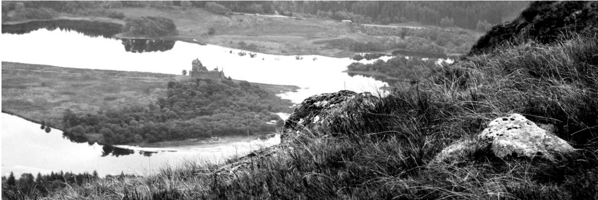
Kilchurn Castle from the footslopes of Ben Cruachan, perched above the eastern fork of Loch Awe at the head of Glenorchy