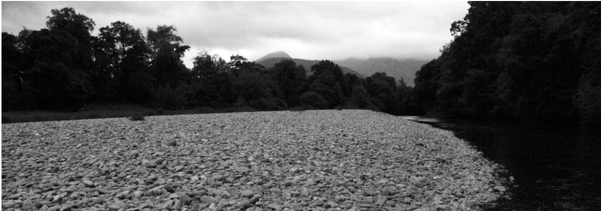
The River Orchy, looking west towards Cruachan. The peak beyond the glen is Beinn a' Bhuiridh, the arm of the mountain that forms Letterbaine, and beyond it Cruachan summit and Glenoe

identity, kinship and community were very much connected with those of the clan on the other side of the River Orchy. Their fathers had fought courageously for the Old Chevalier at Sheriffmuir during the 'Fifteen, but unlike their kinsmen on the Cruachan side of the river, when the Glenorchy Campbells switched loyalties they were not free to choose – and neutrality was not an option.