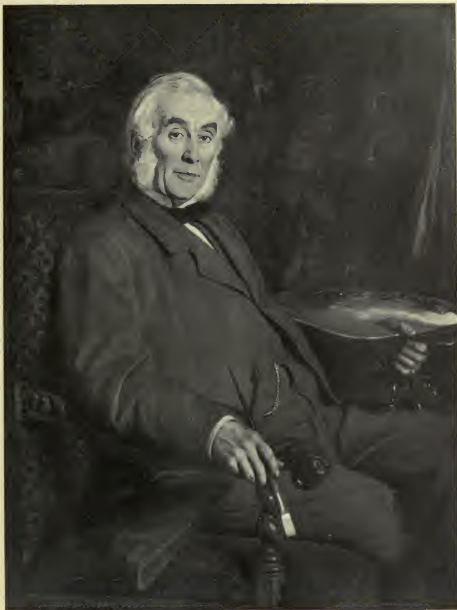
SIR DANIEL MACNEE.