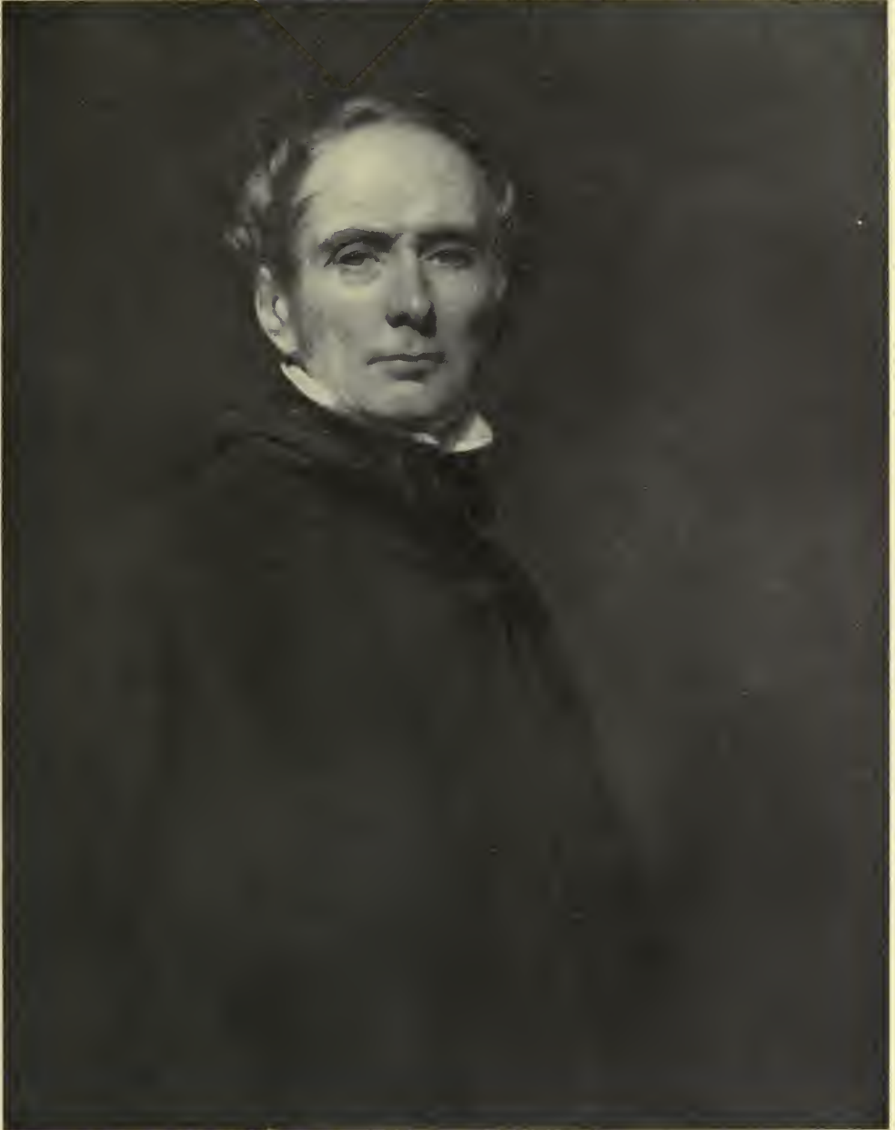
SIR J. WATSON GORDON.