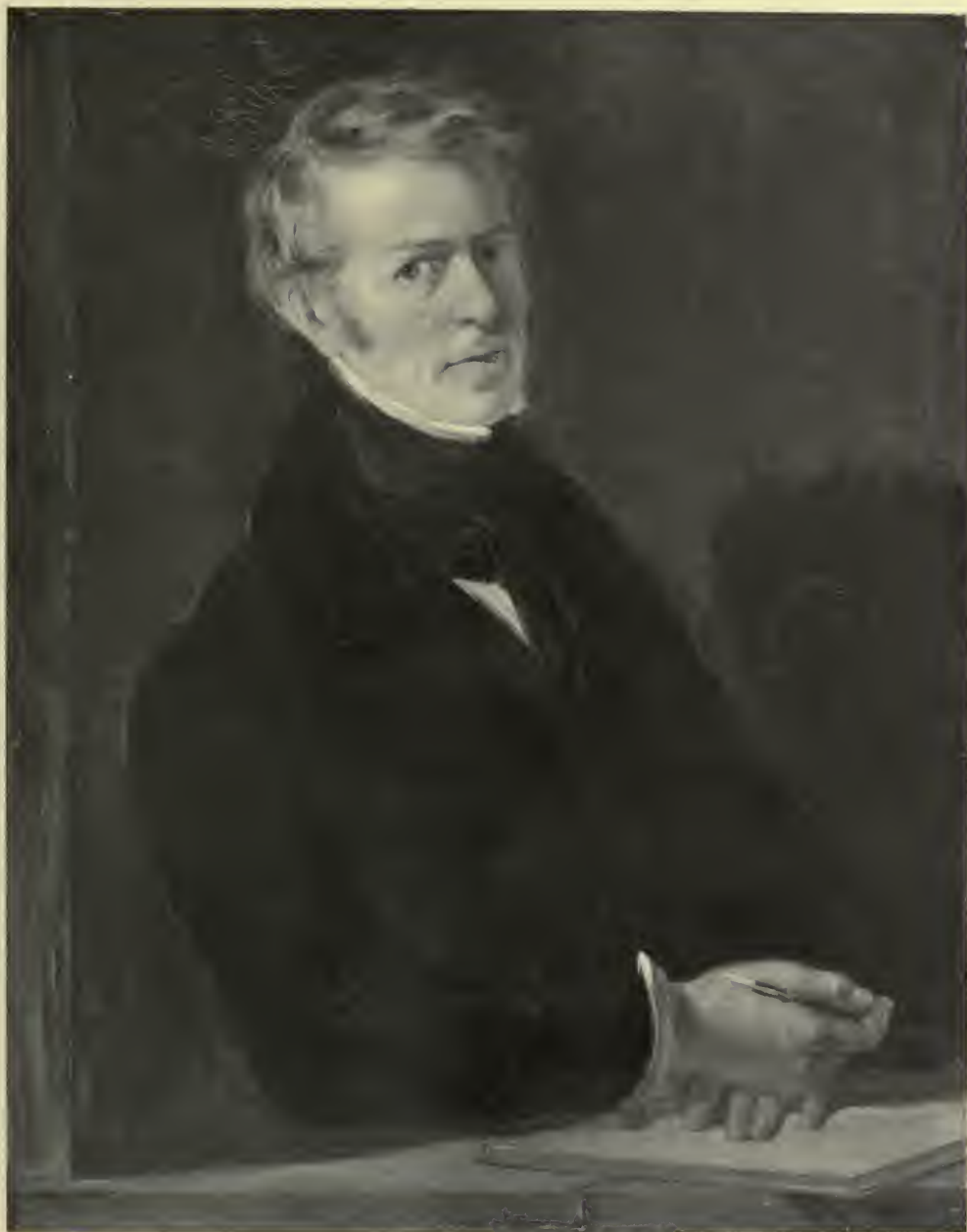
SIR WILLIAM ALLAN.