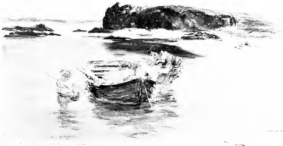
A SUMMER IDYLL—BAYVOYACH