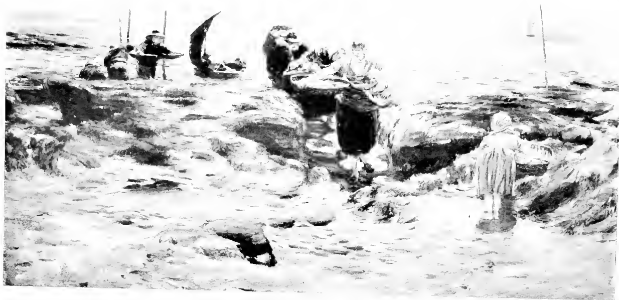
THE FISHERS' LANDING