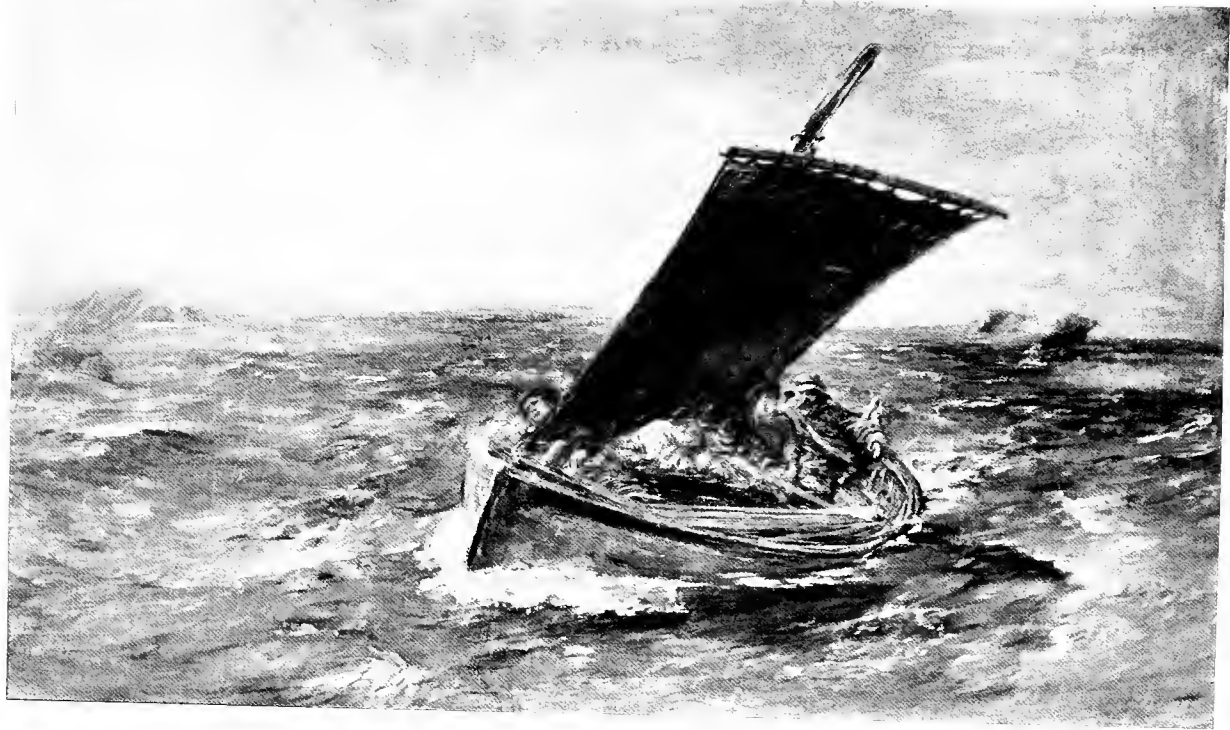
THROUGH WIND AND RAIN