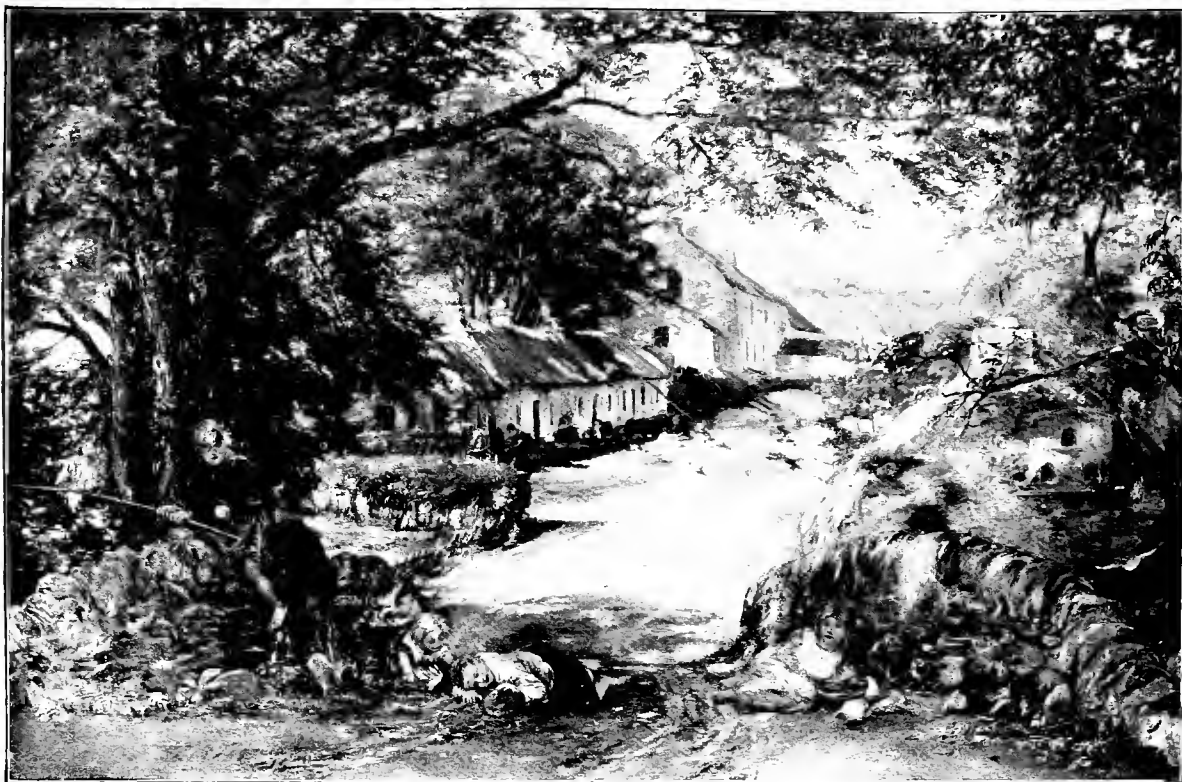
THE VILLAGE, WHITEHOUSE