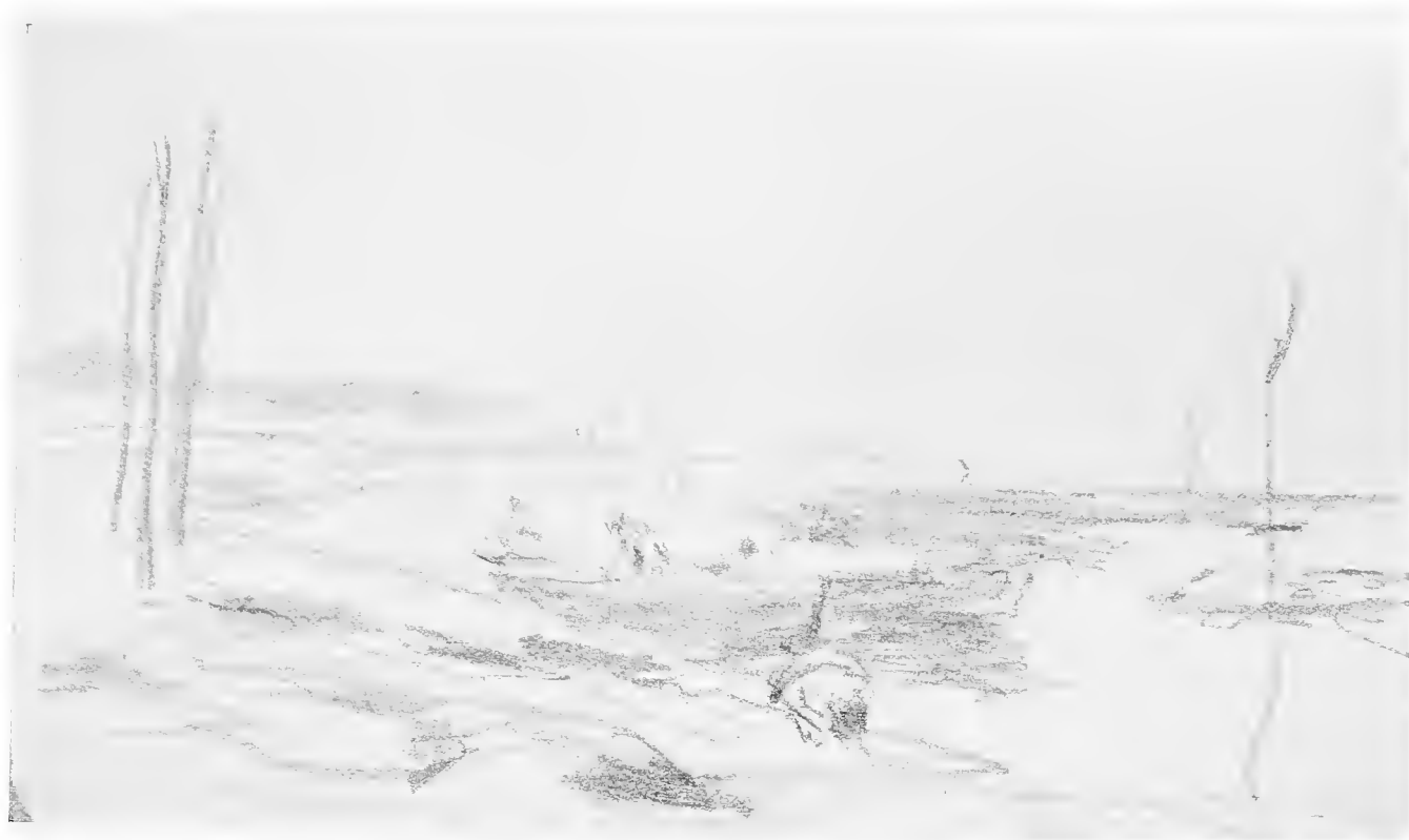
WEST HEAN—PAGE FROM SKETCH-BOOK USED IN 1874