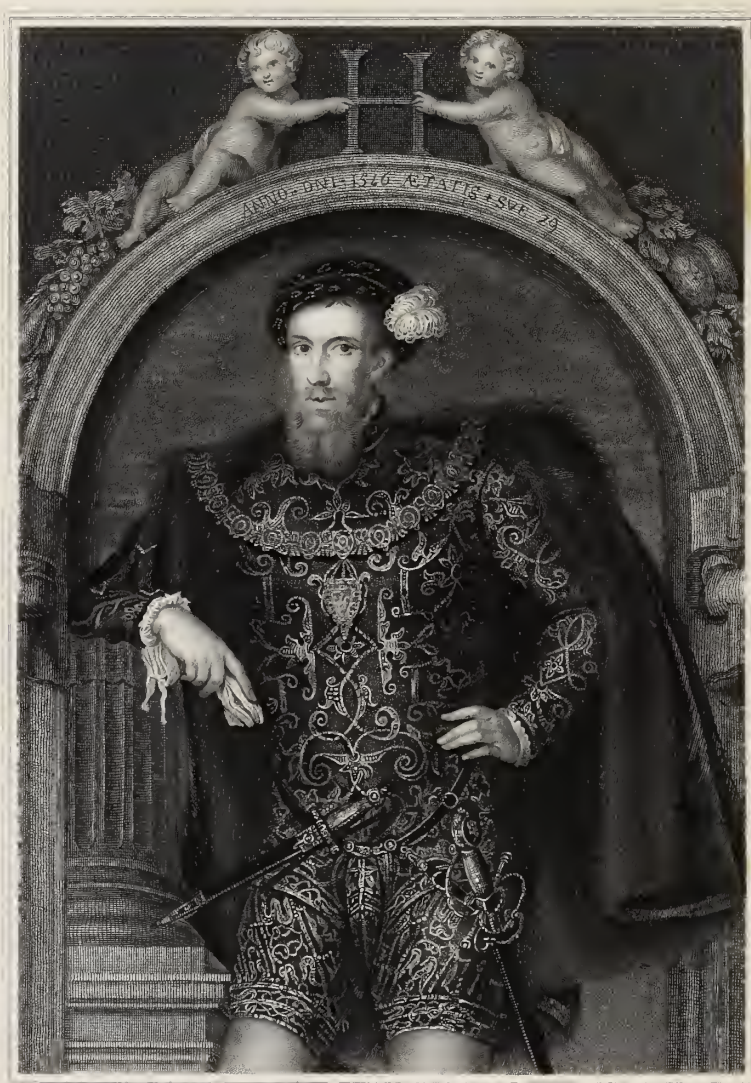
HENRY HOWARD, EARL OF SURREY.