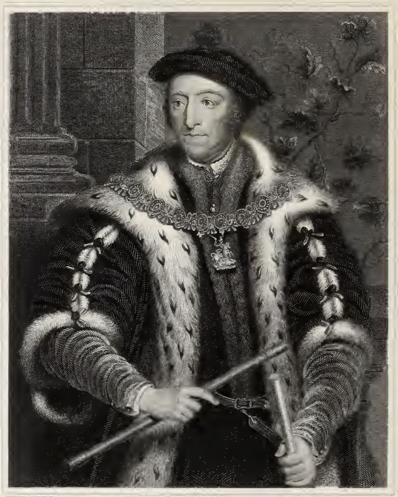
THOMAS HOWARD, DUKE OF NORFOLK.