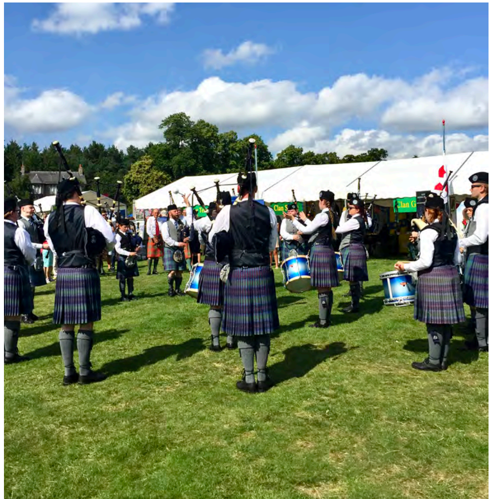
2019 Aboyne Highland Games, Aberdeenshire, Scotland