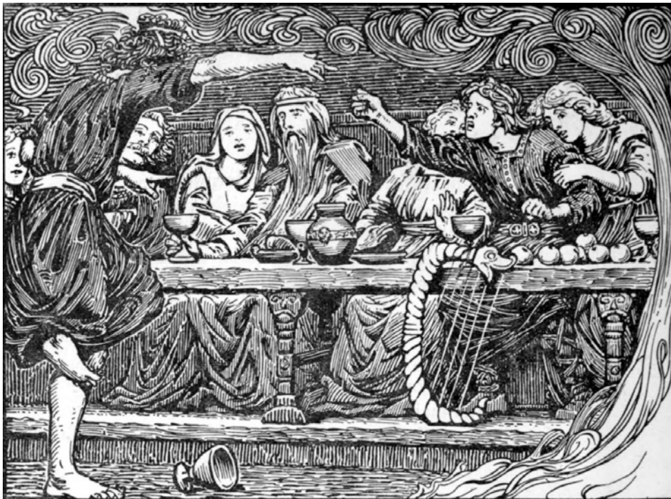
Medieval Bards traded insults in rhyme and rhythm known as “Flyting” for entertainment.

from non-academics allude to the Northern English Barde as a potential origin. Primary sources add to the confusion as 12th and 13th century documentation, written in Latin, spells names to match medieval Latin orthography. An example of this is the double “AA” spelling to represent grave accented “A” as in Baard versus “Bàrd”. The answer most likely is there are many origins of the name and but what we do know is when writers first spelled the name as Baird and Beard in Scotland.