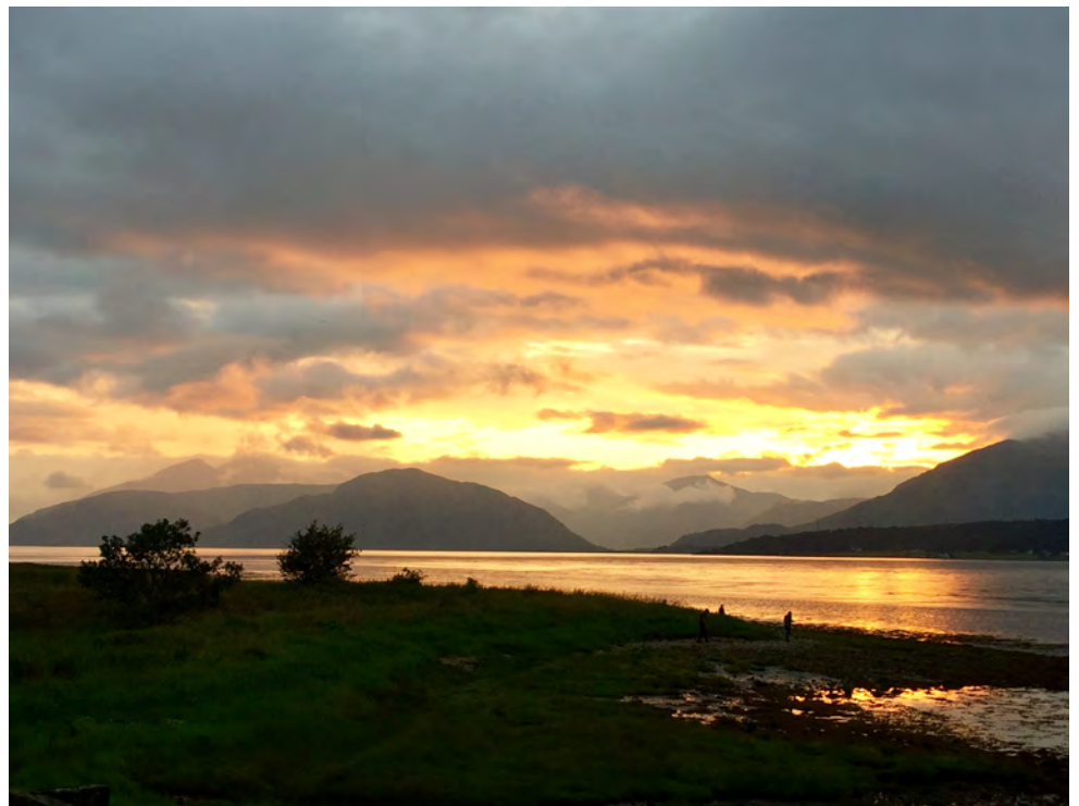
Loch Linnhe looking across to the highlands near Ballachulish, Scotland