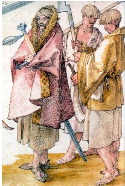
Albrecht Durer's interpretation of the Leine and Brat or woolen overcoat on Scottish mercenaries in Ireland from the Western isles in 1521.

The terms Iersche (Irish) refers to the Gaelic language after Scots supplanted it as a court language. The word, Scottis, originally signified Gaelic but changed meaning as lowland Scots replaced the lan-