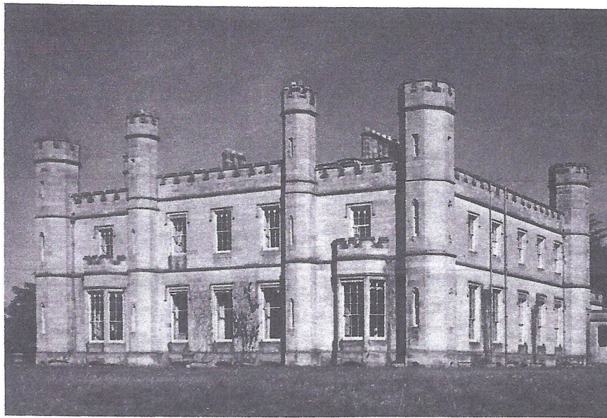
NEWBYTH, near East Fortune, in East Lothian. Home of the last Baronets of Newbyth.