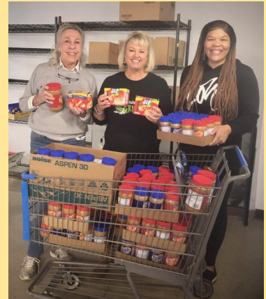
2023 peanut butter drive

One more way to support our Louisville community.