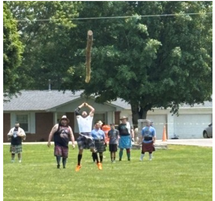
Athletics at the 2025 Southern KY Highland Games