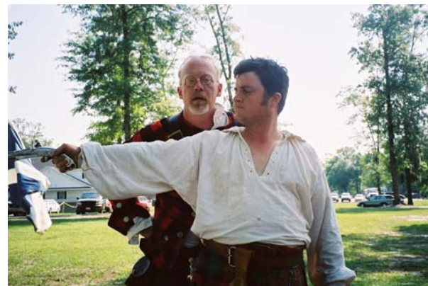
"I've got your back."