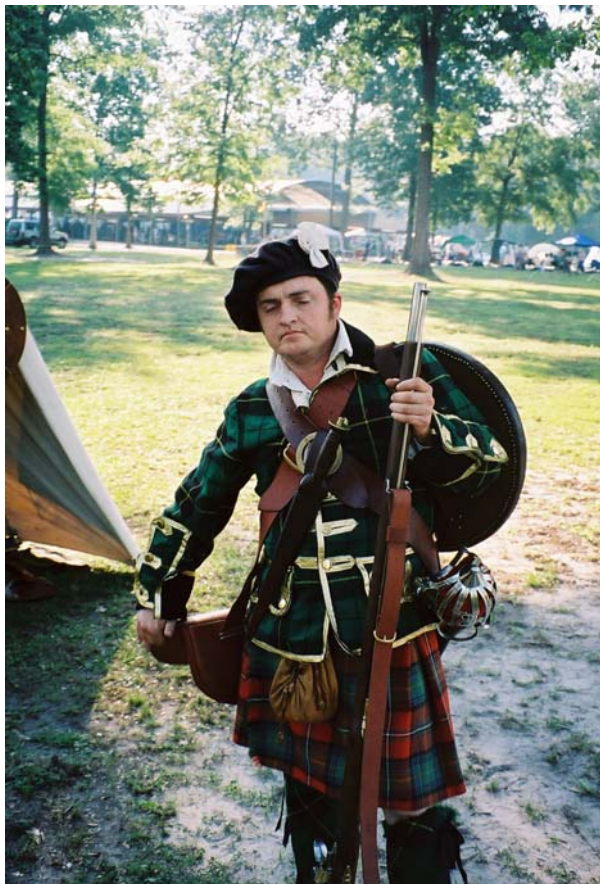
No, he's not hung over, but he did stay at a Holiday Inn Express once.