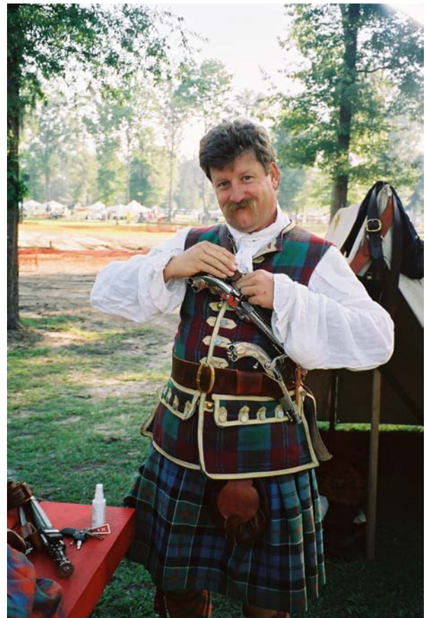
Getting dressed for success. Firing the Murdock pistols was a highlight of the event.