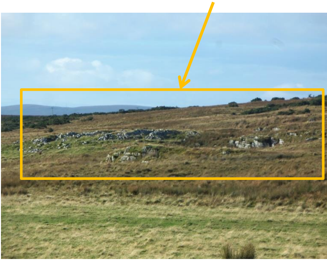
The site is jam packed with the remains of stone rooms and passageways.