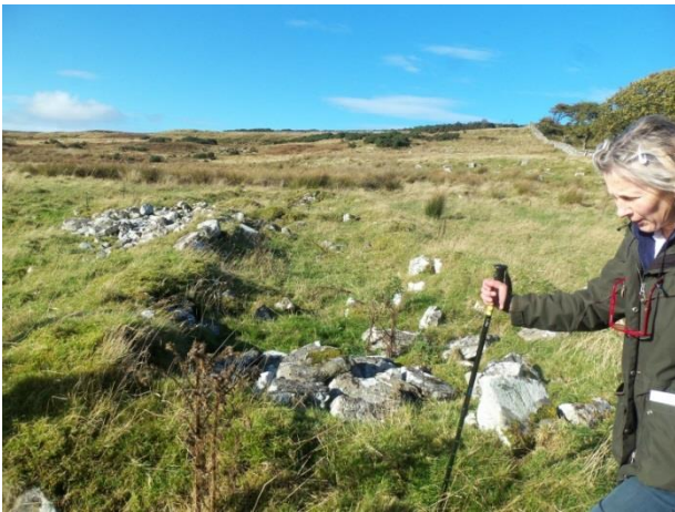
Near this long house was a grain drying kiln.

This was a Norse/Viking long house from a more recent - but still long ago – time, only a thousand years ago or thereabouts. There were several of these along the way, indicating that the valley was a popular place to live for a loooong time.