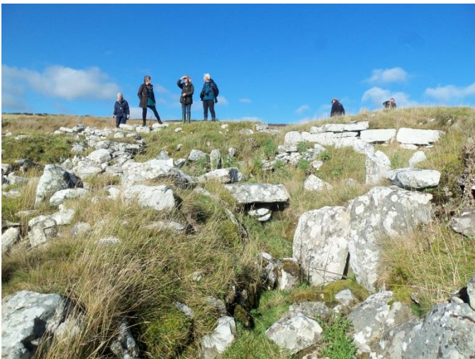
A wag is an archeological term (derived from the Gaelic word for cave) for a galleried rectangular stone building. Here you can see how part of the structure meets that description, and the large stones that formed the gallery and supports

still remain, with one supported gallery stone still in place.