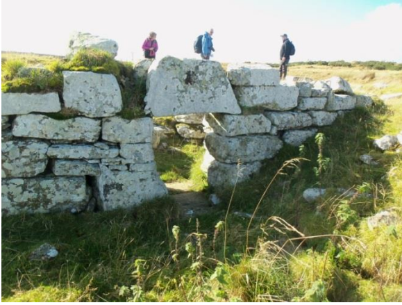
Stairs between the walls of the broch.

Entrances are often still in place due to the weight of the lintel stones