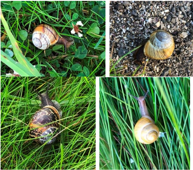
This big blue one had a two inch diameter shell and was near four inches from antennae to tail.