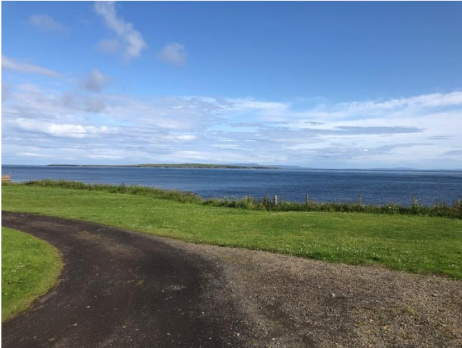
More hiking along the north coast.

It has been a busy summer exploring more of Scotland. We purchased a wee caravan camper, and spent a few nights exploring a bit further along the coast. Here is the view from our campsite at John O' Groats.