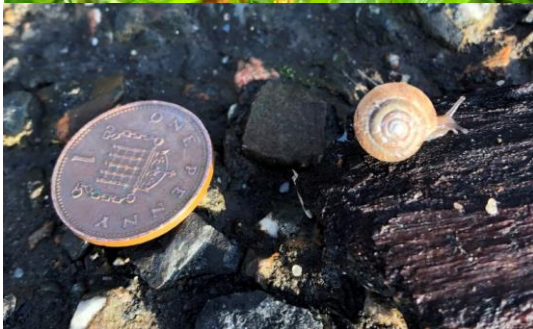
The baby above was 1/3 the size of a penny.

And the truly tiny one resting inside the larger shell below was less than 2 millimeters in diameter.