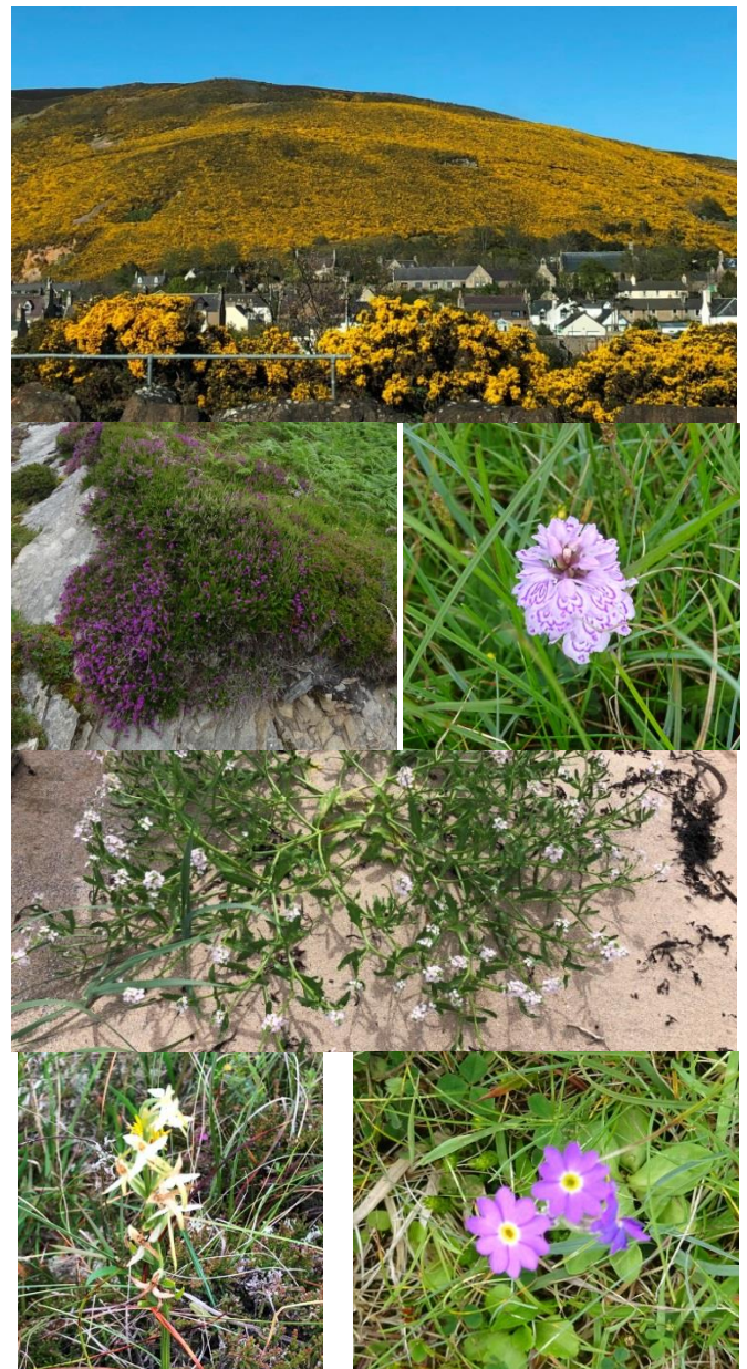
More Highland hiking photos

abloom in golden gorse, Scottish heather, the heath spotted orchid, sea rocket (rocket is what they call arugula here), the rare butterfly orchid, and the rarer Scottish primrose, which in the whole world, only grows on the north coast where we live.