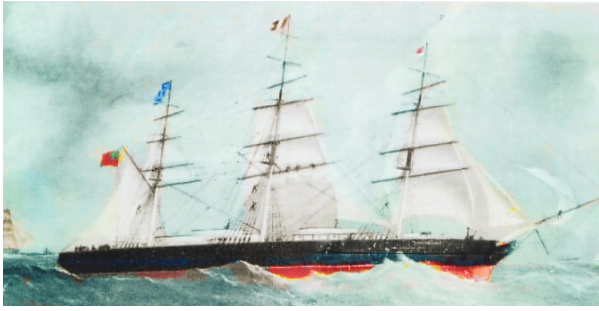
Accrington, formerly steamship Francois Arago