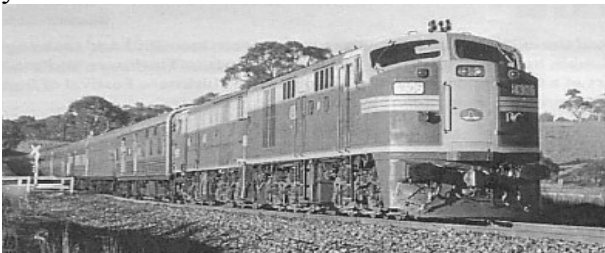
The Southern Aurora

The "Southern Aurora" is a gleaming 1960s Stainless Steel luxury train and you can go by Premier Class with access to the Dining Car or by Standard Class.