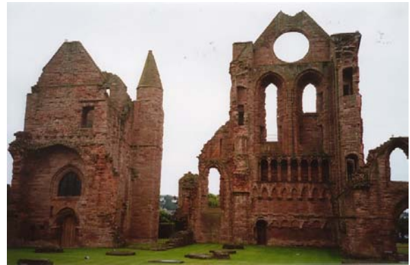
Arbroath Abbey where the 1320 Declaration was signed

He was in the Fleet Air Arm, but was invalided out after an accident. He migrated to New Zealand and after service in World War 11 he settled in Rotorua and died there in 1989, leaving no male heir, and thus this ancient branch of the Leslie family came to an end.