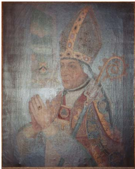
John Leslie Bishop of Ross