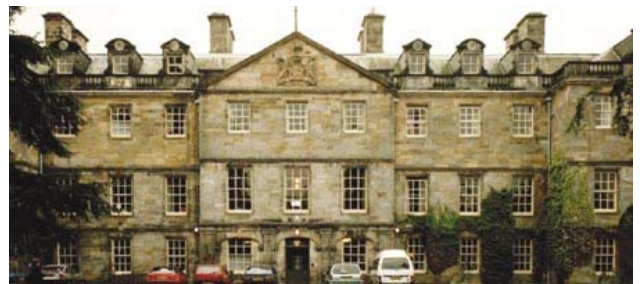
Leslie House today.

The Leslie House petition was well received by the Committee who agreed to write to the Scottish Executive seeking its comments on the Leslie House 21 Groups petition. As they say, we will all be old one day ( hopefully ) and may need residential care, but don't wait until you are old to do something, that will be too late. Do something now.