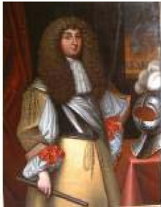
John 7 th Earl of Rothes and 1 st Duke of Rothes

John the 7 th Earl of Rothes and 1 st Duke of Rothes built the first great palace at Leslie about 1670, part of which is the present Leslie House.