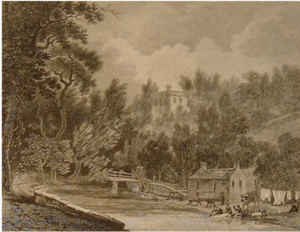
The only known print of Leslie House before the fire of 1763.

Leslie House was burnt to the ground on Christmas Day 1763, apart from the west quarter of the house, the Rothes family lost “every convenience, magnificence and luxury” apart from a few pieces of furniture and some paintings.