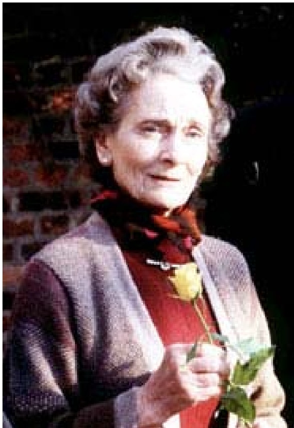
Lady Alice Christabel Montague Douglas Scott, Duchess of Gloucester Late Colonel-in-Chief K.O.S.B.

An article in “The Scotsman” newspaper has drawn attention to the proposed forced merger of the Kings Own Scottish Borderers with the Royal Scots, under a plan drawn up by the Council of Scottish Colonels.