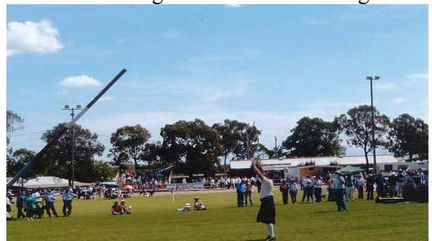
Tossing the Braemar Caber

Well The 135 th Annual Combined Scottish Societies of NSW Inc Scottish Gathering at the Castle Hill Showgrounds has come and gone.