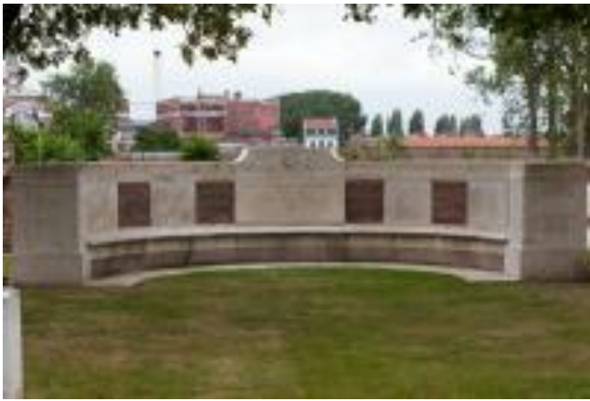
Cite Bonjean (New Zealand Memorial) where 47 NZEF soldiers are remembered, whose bodies were never recovered.