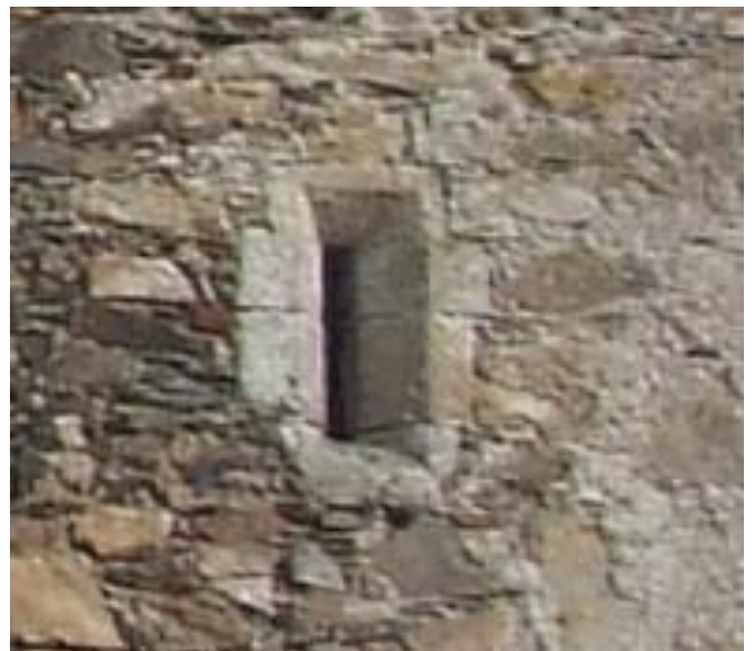
Loop hole on south wall. (S. Bruce).

A book published by the Banffshire Journal in 1919 titled Banff and District written by Allan Mahood former President of the Banffshire Field Club gives a description of the Castle as follows: