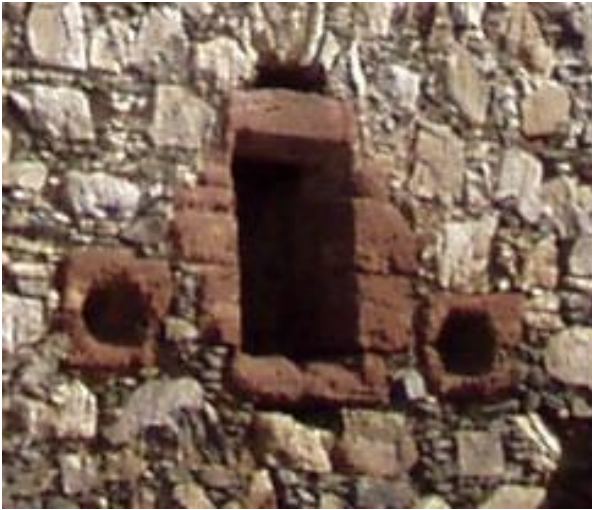
Gun ports on south wall.