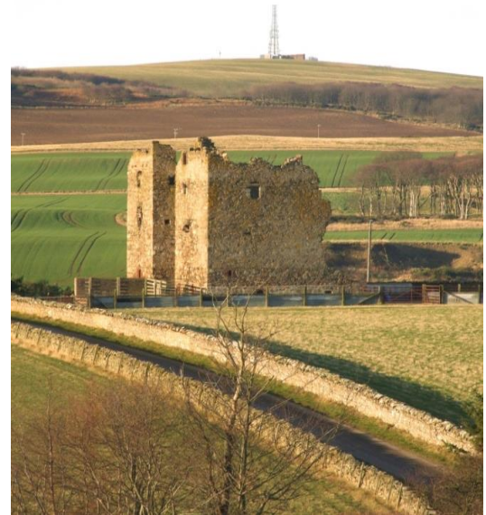
Edin Castle as viewed from the east with the Hill of Alvah behind.