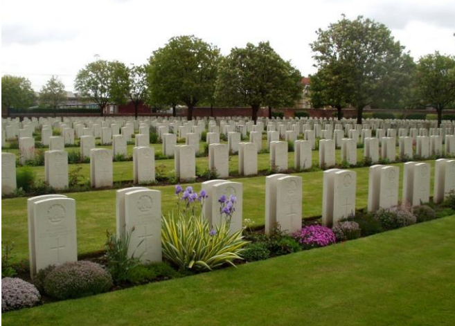
Cite Bonjean Military Cemetery, Armentieres with the graves of 452 soldiers of the NZEF.