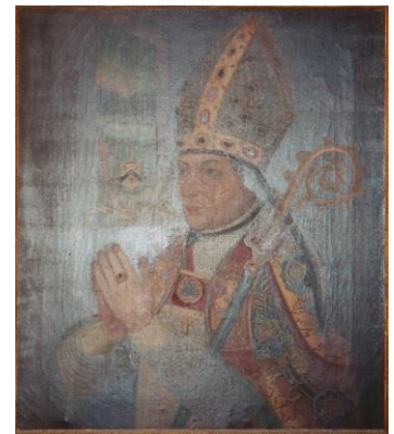
John Leslie Bishop of Ross

John Leslie was educated at the University of Aberdeen, Paris and Poitiers and showed early signs of his academic genius. He taught canon law at King's College Aberdeen, and took his degree as Doctor of Laws. In 1558 he received holy orders and was appointed official of the diocese of Aberdeen.