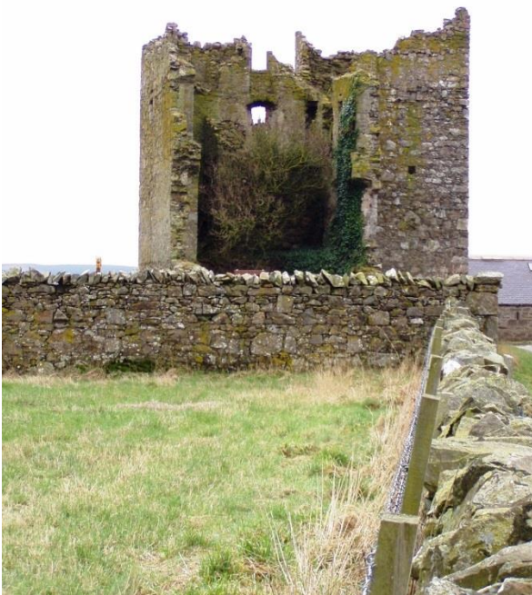
Edin Castle as viewed from the north.