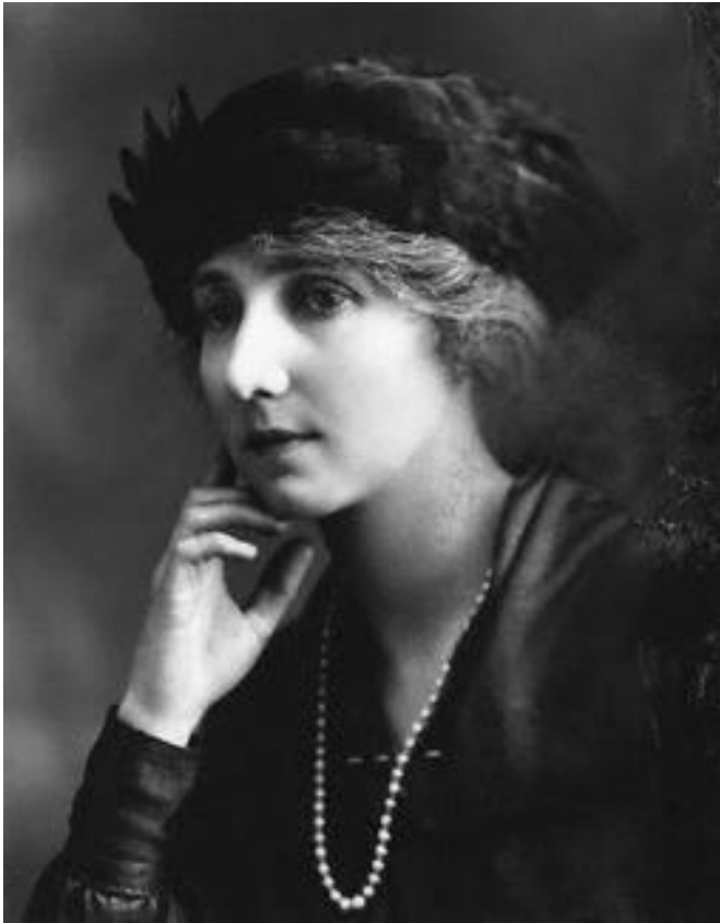
The Countess of Rothes 26 April 1917.