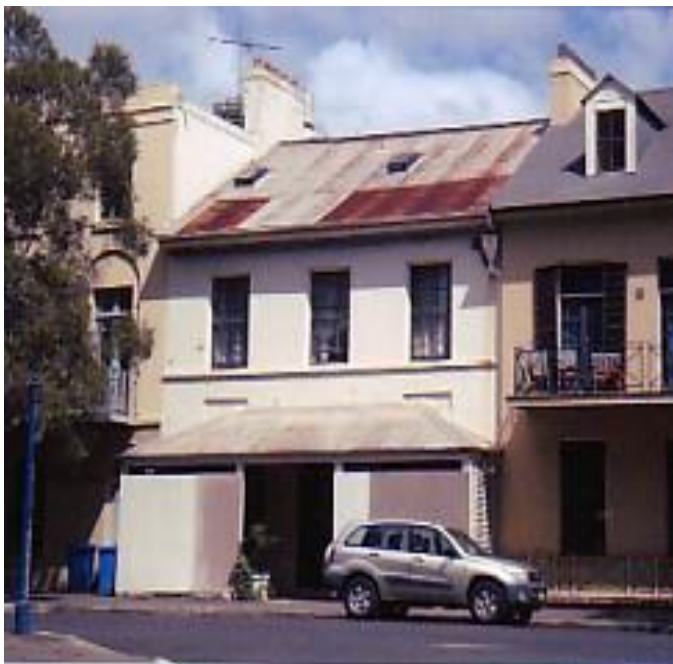
The front of 37 Lower Fort St, The Rocks

Immediately above Pitman's Wharf, between it and Fort Street were "Four ample and delightful plots of Building Ground, situate in Fort Street, commanding a fine healthful prospect of the two Harbours, surrounded by the most respectable neighbours. The allotments are capacious for the building of genteel residences, and command an available frontage each upon the line of street, of 24 feet each; extensive depth, and a carriage road to the rear of 20 feet in width." In June 1833 these four vacant blocks were part of Pitman's estate and for sale. An 1834 survey recorded this land as Lot 8, Section 90, on which were built the houses at numbers 37 and 35, the stone walls to the rear of number 37 and a store to the rear. The survey also recorded Edwards and Hunter's claim over the land, which was formalised in a Crown Grant the following year. The pair of town houses designed by John Verge was built on the south eastern corner of Lot 8 after the survey and so is not shown on it. The house at number 35 was built by the time of the 1834 survey but after number 37, making the likely date for the erection of number 37 to be late 1833.