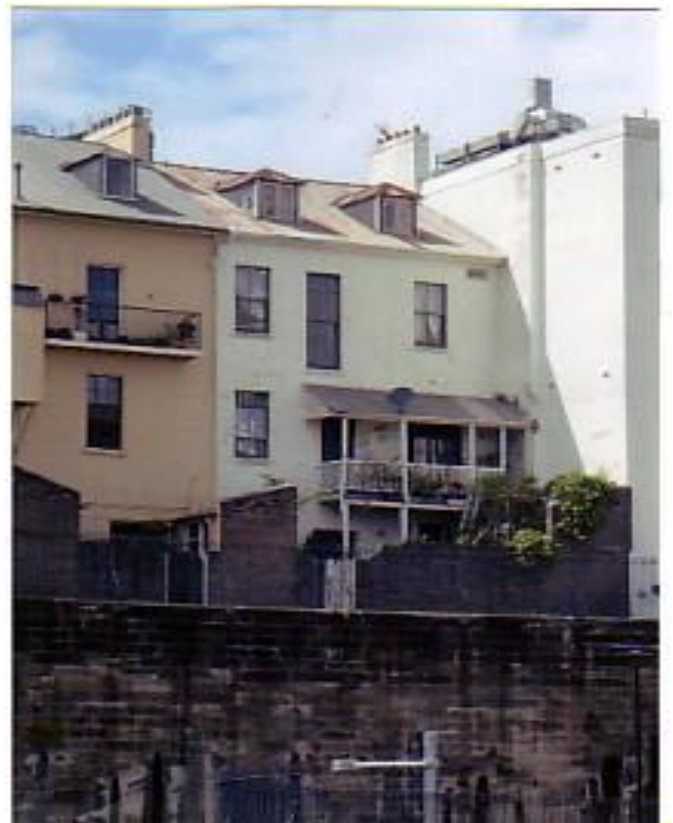
The back of 37 Lower Fort St, The Rocks.