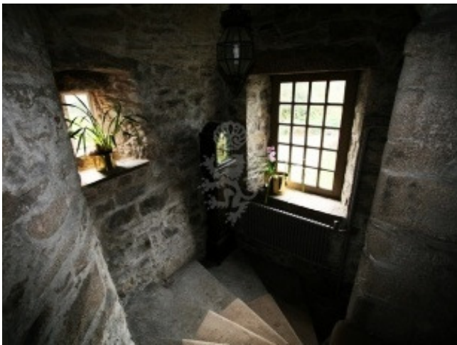
Spiral Turnpike Stairs.

The position of the kitchen would seem to indicate that when it was built in the 17 th century, it was in a detached building.