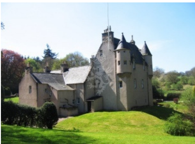
Rear of Lickleyhead Castle