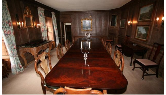
Lickleyhead Dining Room