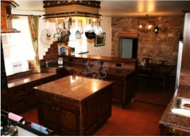
Lickleyhead Castle kitchen.

The position of the kitchen would seem to indicate that when it was built in the 17 th century, it was in a detached building.