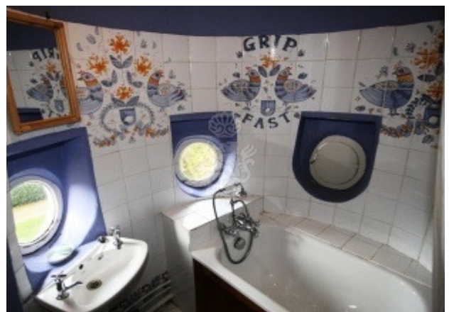
Lickleyhead en-suite bathroom.