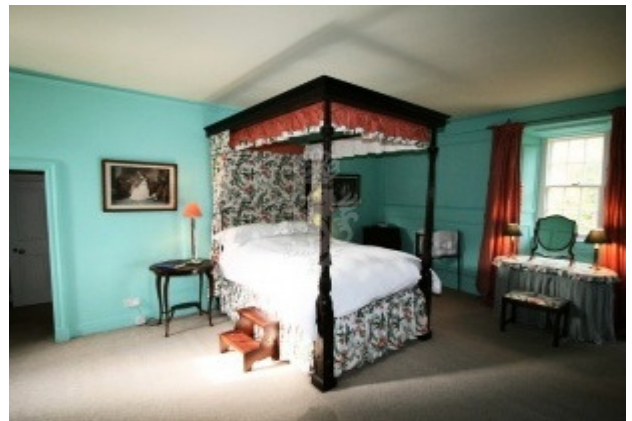
Four Poster bedroom.

The oldest part of the Castle is the rectangular tower although it is unlikely that any section of the current Castle predates the Leith purchase in 1499.