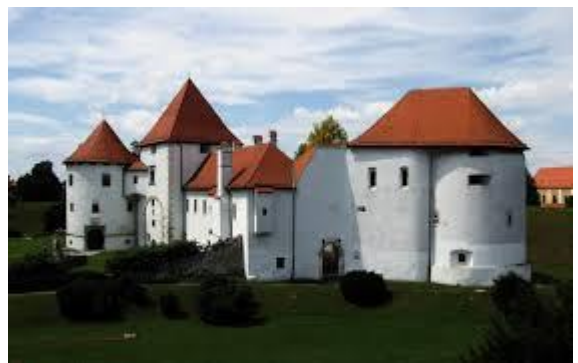
Stari Grad Castle. Croatia

consummate the plan, compelled Walter and his fellow officers, having already slain the chief members of his staff, to put Wallenstein to death in order to save the Imperial forces and secure the defence of the passes and thus it was done on February 25, 1634. In this day and age of Instant communication we cannot appreciate the momentous decision that befell these three men. They were on the scene, they had to act, they alone had the decision to make. Imagine the hushed and excited conversations. The plans made and discarded. Then as events rapidly developed, the ultimate course of action decided upon, a choice that required instant action. As men of principle and character, they had the courage to act. For these courageous acts of fidelity, the Emperor, Ferdinand II, in addition to expressions of Imperial favour, made Walter a Captain of his own Body Guard, the Colonel of a Regiment and the Governor of a Garrison. Walter performed well in his new capacities and was held in high esteem by the Emperor's son. In 1637 when the son succeeded his father as Emperor Ferdinand III, he made Walter a Count of the Holy Roman Empire, Lord of Neustadt in Austria, and Pittau in Bohemia. In due course, the Emperor also appointed Walter, Count Leslie, to the office of Imperial Chamberlain and Privy Councillor, and was made Lieutenant and Governor of Verazdin, Warden of the Borders of Slovenia and Sclavoni.