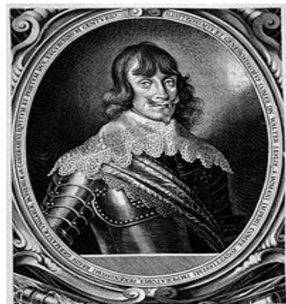
Count Walter Leslie