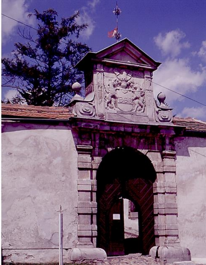
Ptuj Castle with Leslie Crest

from its hill-top position dominates a broad section of the Orava River valley.