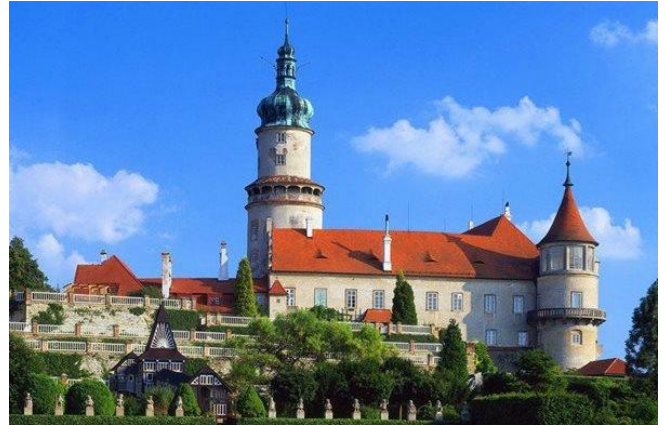
Nove Mesto Nad Metuji Castle. Bohemia