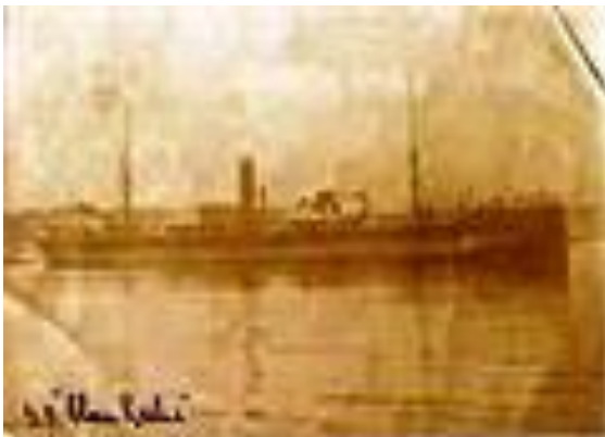
SS Clan Leslie.