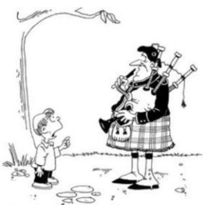
"Maybe your pet would stop screaming if you didn't squeeze him so hard."

An old formed track, marked by a single gnarled totara post, leads to the homestead site of stone foundations and chimney remains, inside a stand of macrocarpa trees. These trees are common settler homestead site markers. The two Leslie family farms were humble subsistence economies, with money scarce. Above the site of the Arnott house, on the shoulder of Peggy's Hill, the ruins of a grander series of farm buildings overlook the sites of the modest homesteads. This farm stead, once accessed through an arched entranceway, consisted of a cow byre, stable, barn, and dairy, and along with the farm manager's house, formed William Larnach's model farm (Figure 8). While Larnach's castle now forms a focal point on the peninsula,.