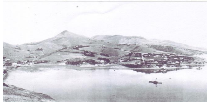
Harbour Cone from Portobello