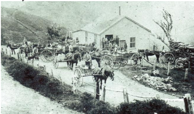
Taieri & Peninsular Milk Company